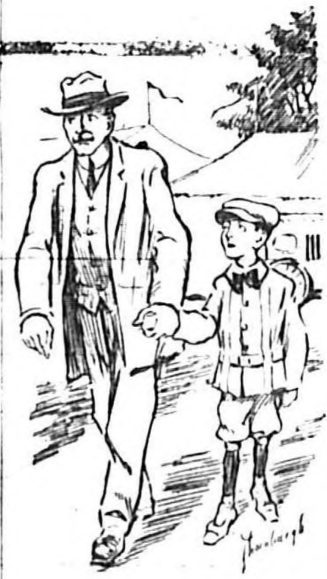
Fifteen Minutes Later Birt Was Leading From the Place the Recovered Boy.

I have learned," Birt wrote "that you have misjudged your wife, just as