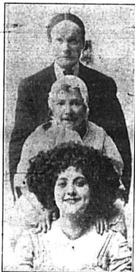
Newlyweds and their Baby.