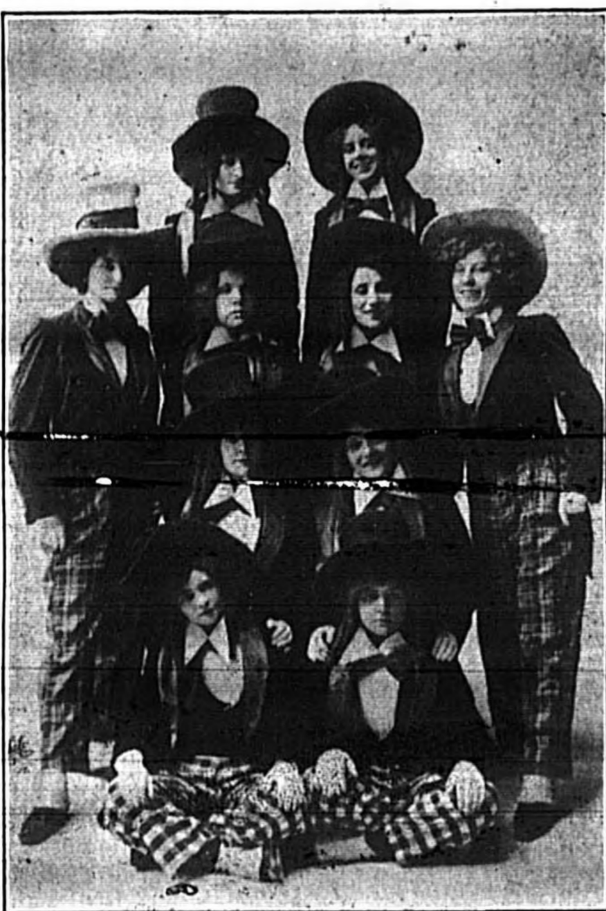
NEWLY-WEDS AND THEIR BABY

Plain Beach was first, St. Lucie second and Osceola county third. You have room to grow if you want to grow.