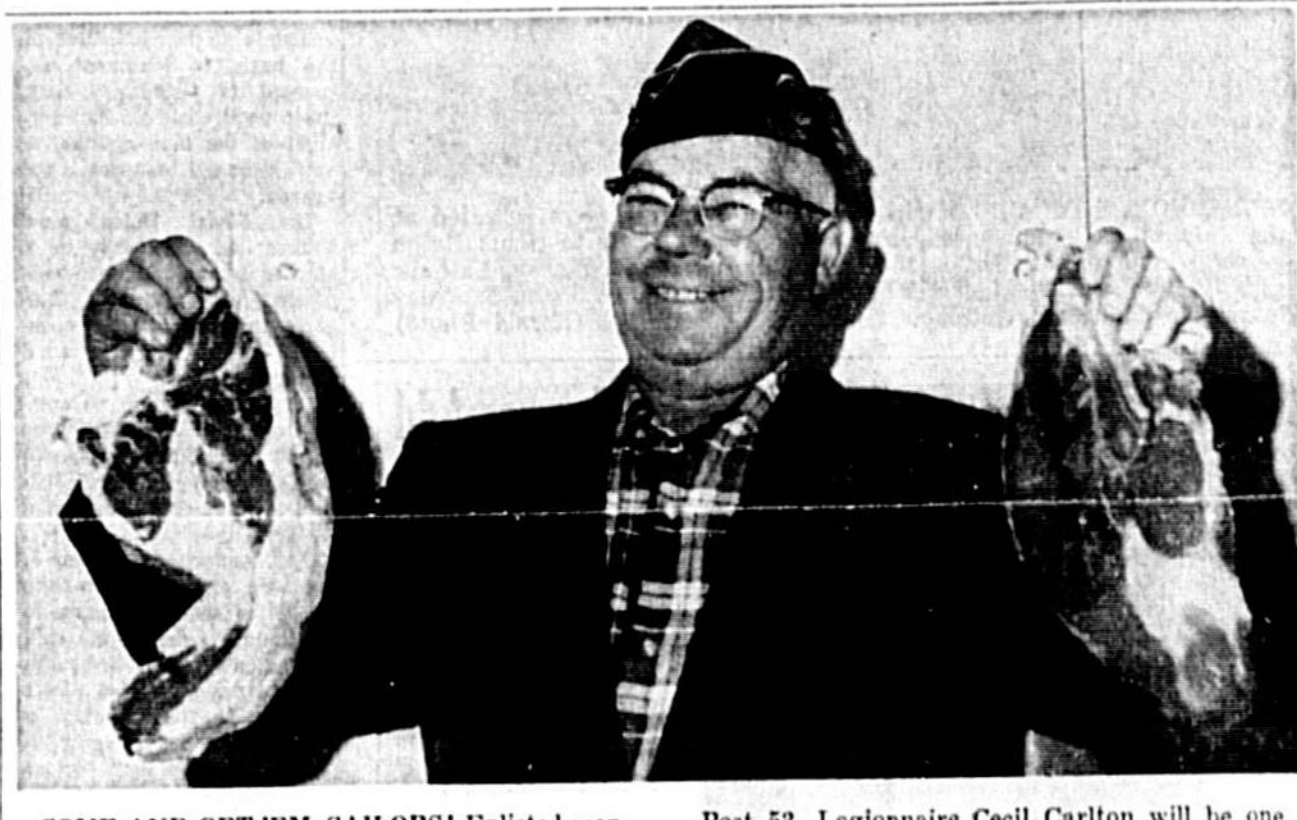
COME AND GET 'EM, SALIMORS! Enlisted men at Sanford NAS will feast on steaks Friday night, though the courtesy of American Legion.