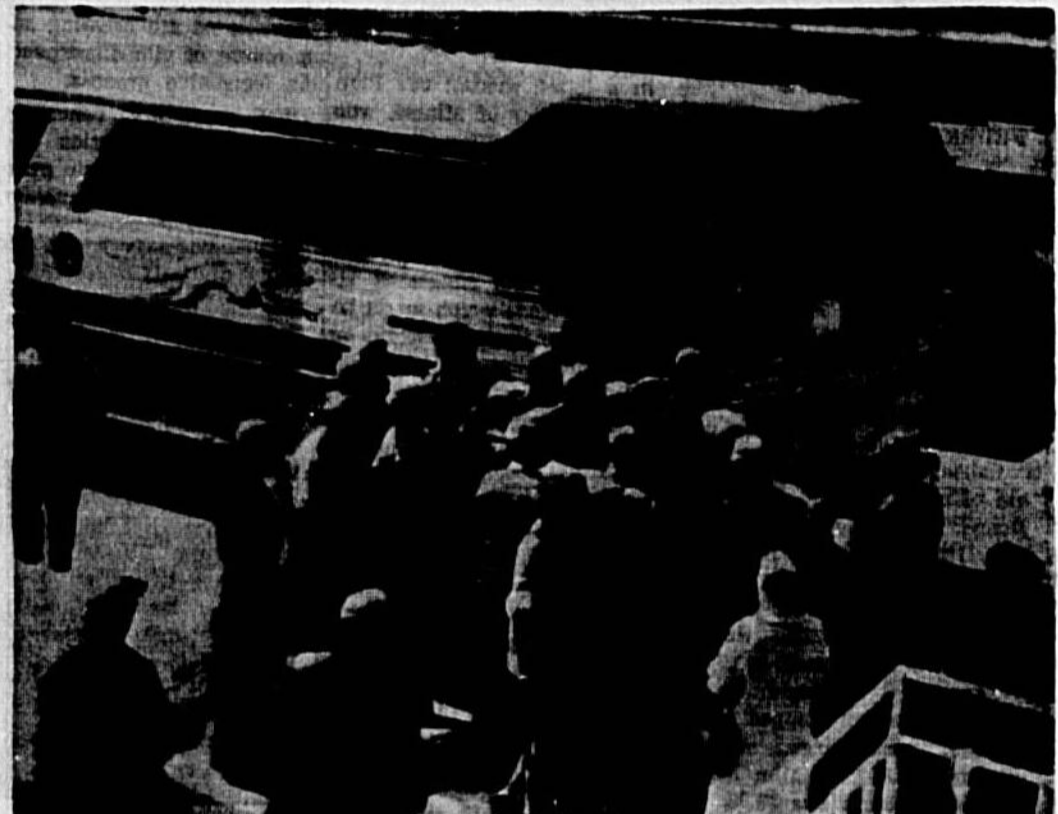
"TAKE Me Out to the Ball Game" could well have been the song sung by members of Deltona's Pennsylvania Club as they boarded buses for a field trip to see exhibition game between the Minnesota Twins and Detroit Tigers.