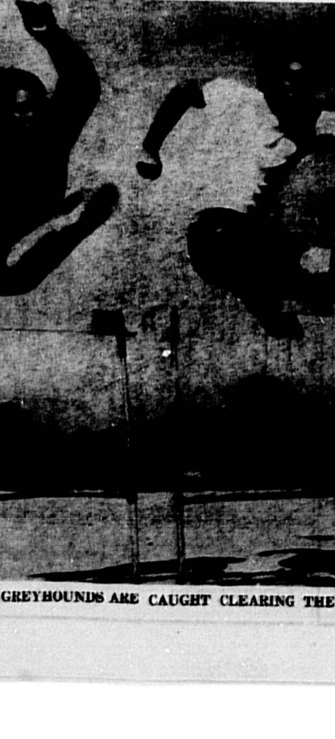
LEAPIN' LYMAN GREYHOUNDS ARE CAUGHT CLEARING THE HURDLES.