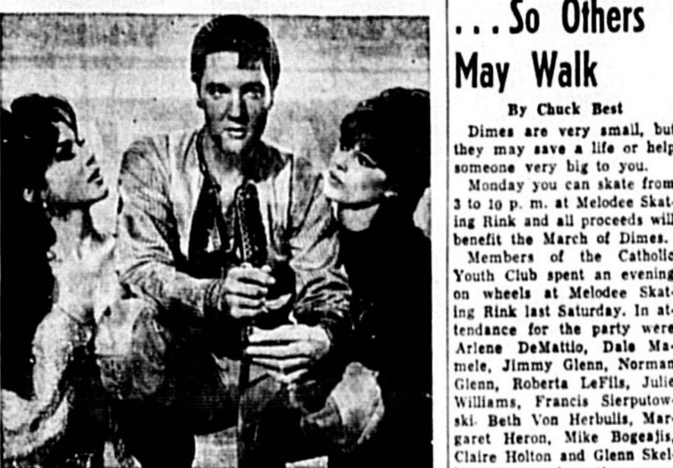
ELVIS PRESLEY is involved in two romantic entanglements...