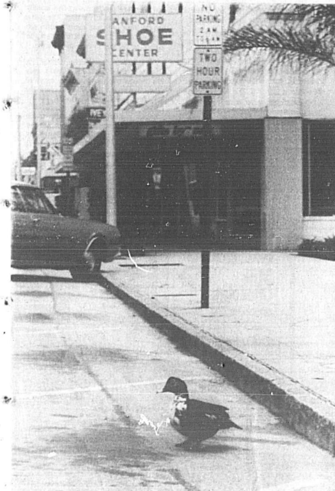
WEB-FOOTED PEDESTRIAN Why did the duck cross the road? To get to the other side — of Sanford's First Street.