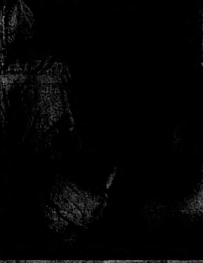
THE IRON LUNG, a mechanical device which enables the paraplegic victim in breathing when unable to longer perform their function, has proven one of the greatest assets to medical science in relieving a cure for the disease. Patients can live for months inside the apparatus.