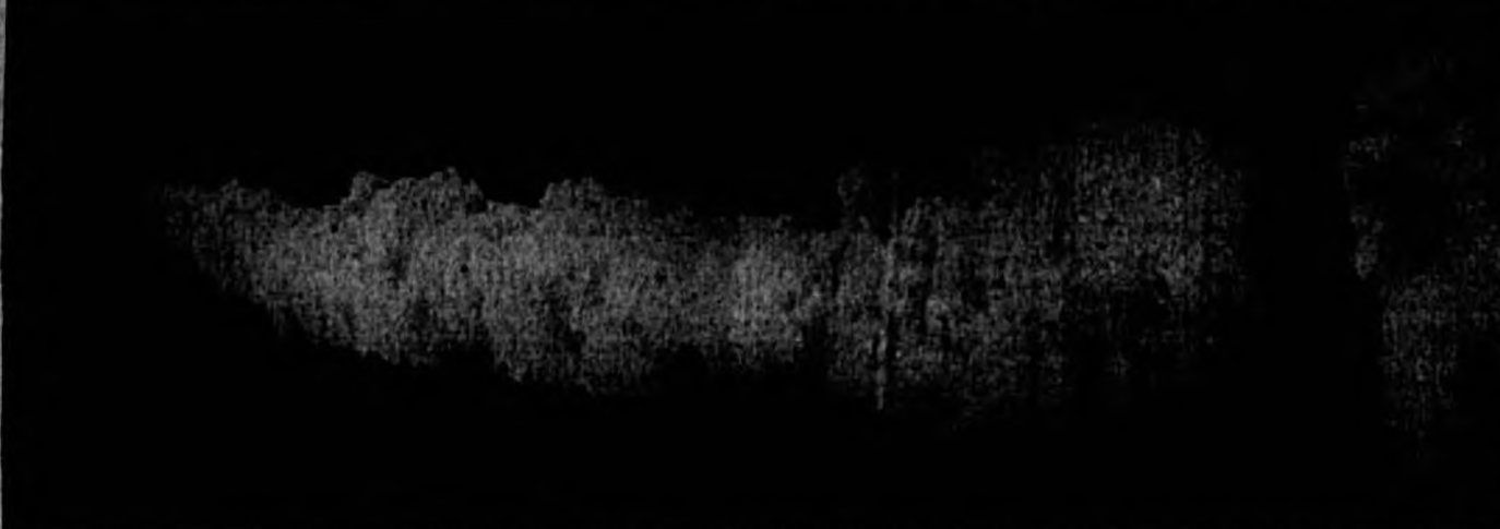
THE ARMY HAS A GOOD SMOKE at the chemical warfare school at Edgewood Arsenal, Md., where army, navy and marine corps officers are trained in use of smoke and chemical agents. An airplane is shown here laying down a smoke screen to hide ground forces.