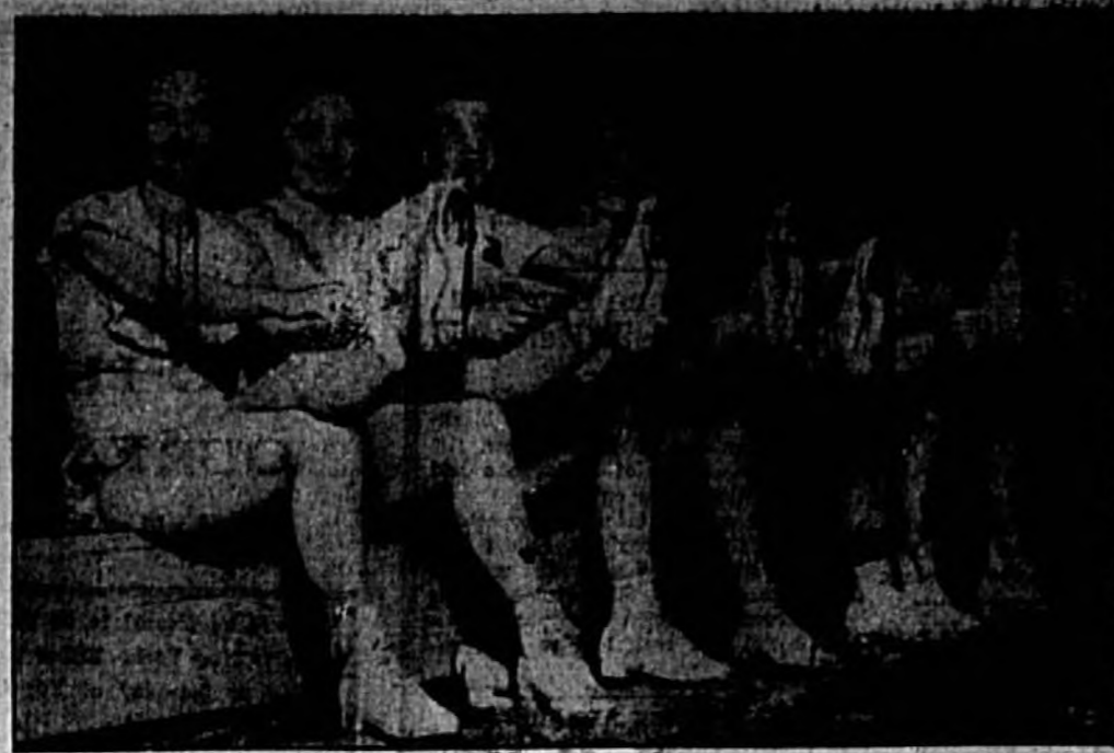
CHORUS ON ICE. Little old London was getting ready for a new spectacle in the way of entertainment. An ice skating rink was laid on the big stage of the Coliseum for a pretentious show, "St. Moritz." Here are some of the shapely ladies of the company getting ready for rehearsal.

There are 717 pens for rearing birds in California, mainly by the state or sportsmen's clubs.