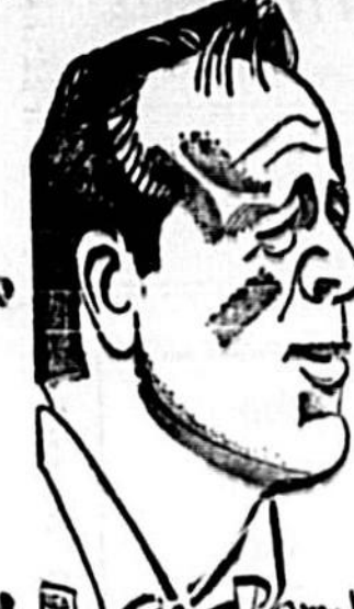
ARNIE PALMER began his comeback trail this past weekend when his 72-hole score of 273 won the Los Angeles Open's top prize of $110,000.

Use Weekend World Jan. 10, 1966 — Page 7