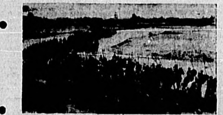
HERE is a scene from "Sign of the Gladiator" coming to the Movieland Drive-In Sunday.