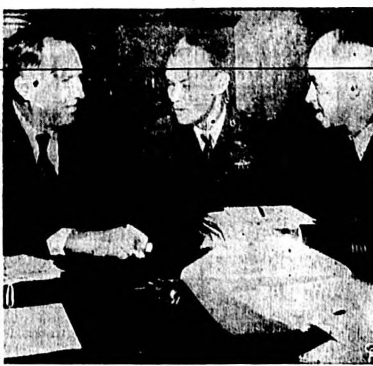
SHORTLY BEFORE HE URGED the Senate Armed Services Committee in Washington to support a bill fixing the active strength of the Army at 377,000, Secretary of the Army Kenneth Royall (left) is shown waiting to testify. With him are Air Force Chief of Staff Hoyt Vandenberg (center) and Army Chief of Staff Omar Bradley. Royall declared that while war is not imminent it is "at least a possibility."