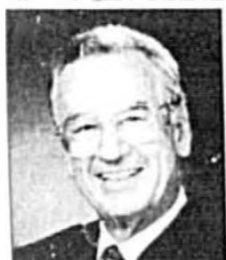
ZIG ZIGLAR Best-Selling Author #1 Motivational Speaker "Relationships: The Key to Success In Life"

PRESENTED BY PETER LOWE INTERNATIONAL - A NON-PROFIT EDUCATIONAL ORGANIZATION