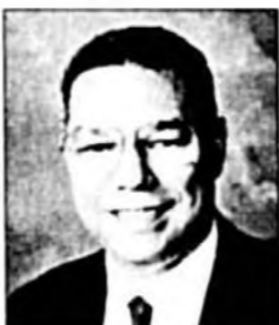
GEN. COLIN POWELL Former Chairman of the Joint Chiefs of Staff "Coping with a Changing World"