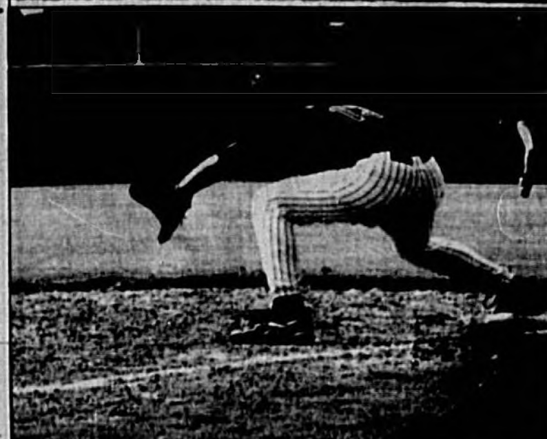
State Tournament Friday at Eastmonte Park in Altamonte Springs. But things did not go as well on Saturday as both Longwood and host Altamonte Springs were eliminated from the tournament, which will have two Jacksonville area teams, San Jose and Westside, meeting for the championship.