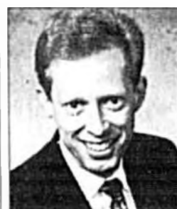
PETER LOWE America's #1 Success Authority "The Five Levels of Success"