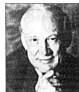
BUZZ ALDRIN Legendary Apollo 11 Astronaut Special Guest Speaker