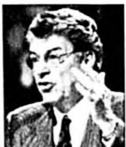
CHUCK DALY Orlando Magic Head Coach Special Guest Speaker