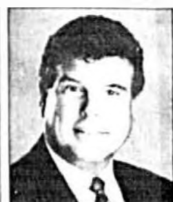
TOM HOPKINS Top Sales Trainer & Million Selling Author "Selling with Integrity"