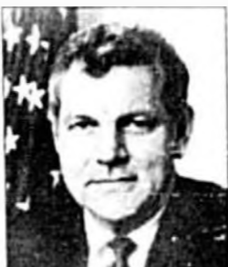
WILLIAM BENNETT Distinguished Statesman and Best-Selling Author "Empowering America"