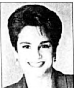
MARY LOU RETTON America's Most Beloved Olympian "The Competitive Edge"