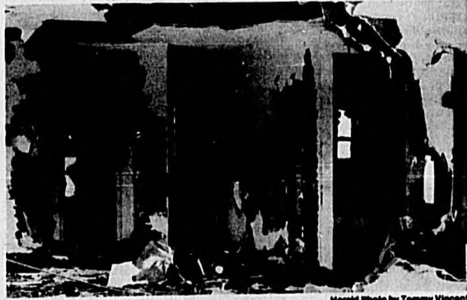
The interior of a house deemed a nuisance by the county.