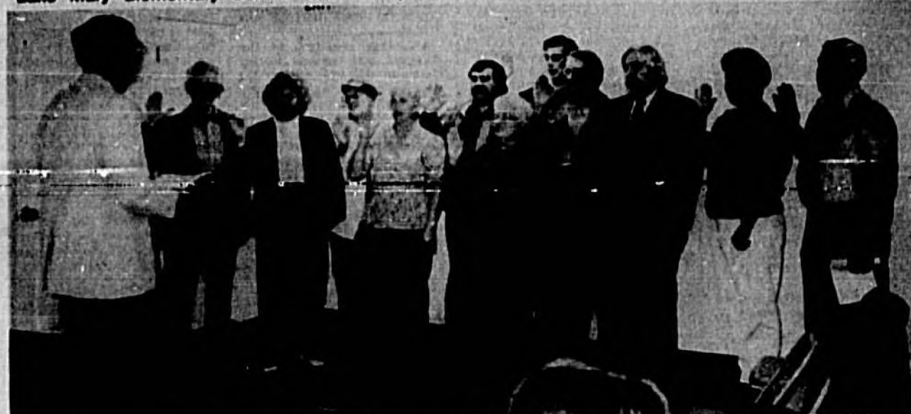
Newly installed officers and directors of the Community Improvement Association, Inc., were sworn in during a recent general membership meeting.