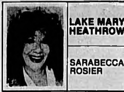
LAKE MARY HEATHROW