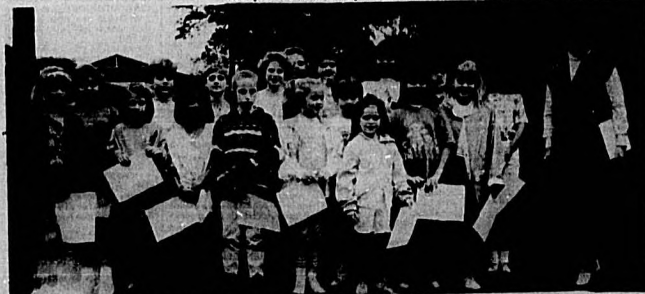
Some of the students from each of the classes at Lake Mary Elementary School received special recognition for their contributions to the Arbor Day Celebrations.