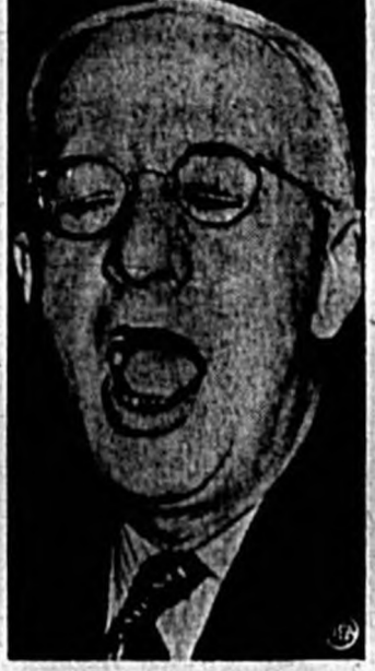
Former Governor of New York Alfred E. Smith, whom President Roosevelt christened "The Happy Warrior," is pictured in New York, making his recent forceful speech supporting the Administration policies on the Neutrality Act.