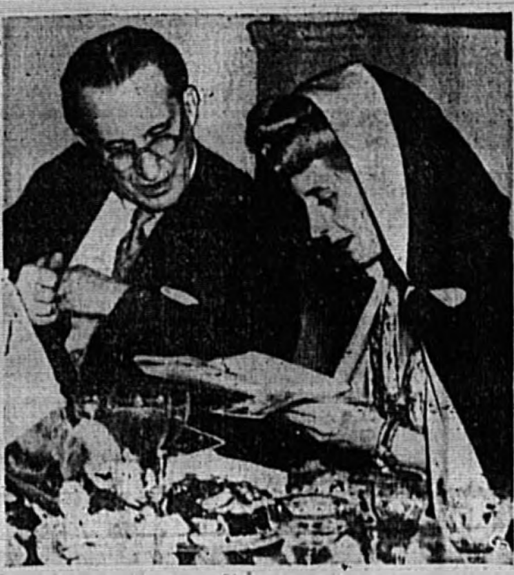
BETWEEN COURSES at a dinner given in her honor in Rome, Italy, Mme. Eva Duarte Peron, touring wife of the President of Argentina, sits with Premier Alcide de Gasperi and admires some photos of various phases of her visit to the Eternal City and to Spain.