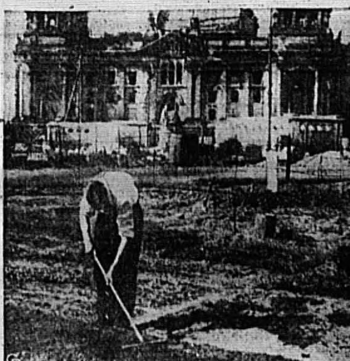
BEFORE THE SHATTERED Reichstag Building in Berlin, which once echoed Hitler's hysterical ranting, a resident of the German capital carefully rakes his vegetable garden. With food rationed tightly, Berliners have resorted to growing it in tiny plots in the bomb-blasted streets to round out scant menus.