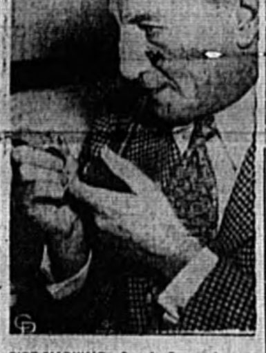
PIPE-SMOKING Lord Inverchapel, British Ambassador to the U.S., is shown aboard the S.S. Queen Elizabeth, just before he sailed from New York for his home in Scotland for his first vacation in seven years. He made a last-minute purchase of ten pounds of butter and eight pounds of bacon at a neighborhood store.