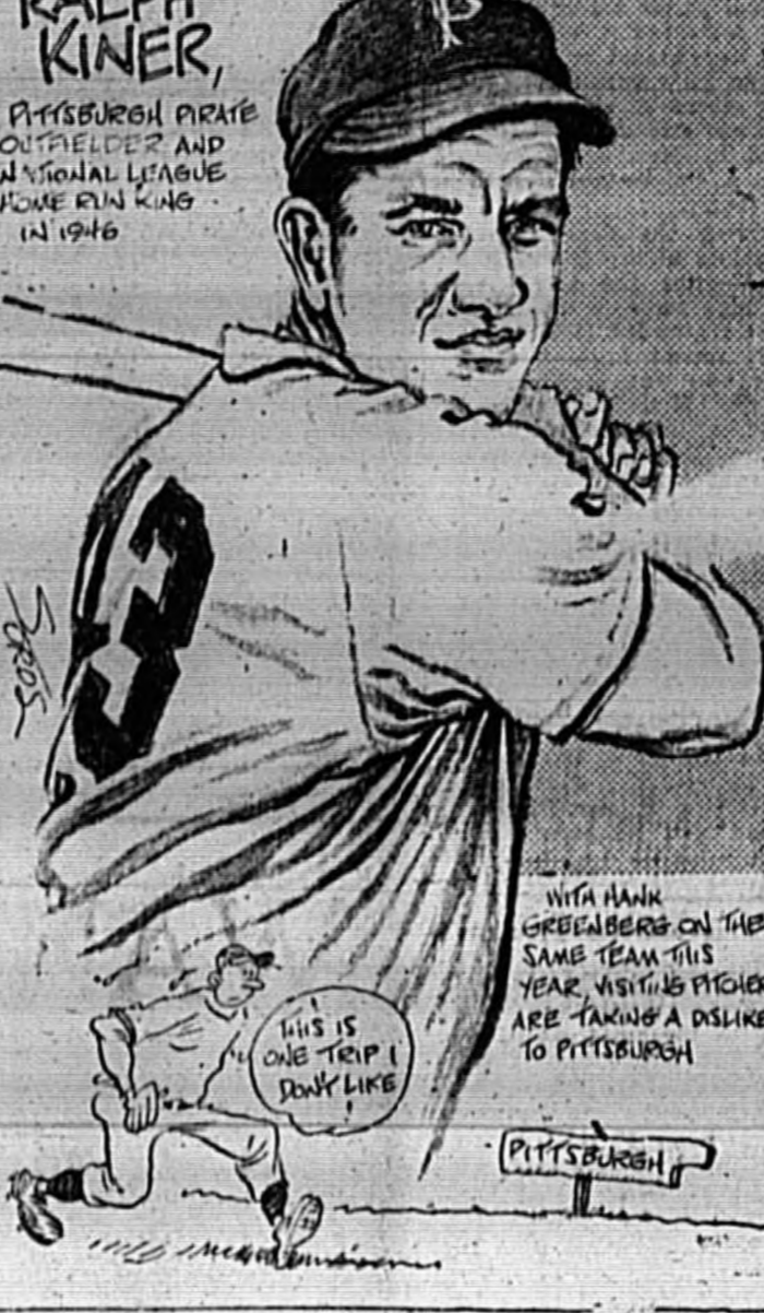
RALPH KINER, PITTSBURGH PIRATE OUTFIELDER AND NATIONAL LEAGUE HOME RUN KING IN 1946