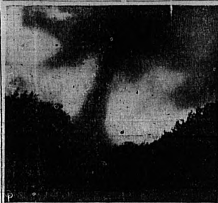
THIS SPECTACULAR PHOTO of a twister on the war path was taken as it raced along an area about two miles north of Spearfish, S. D. Six persons were killed and a score of others injured as the twister wrecked scores of homes and farms in a 10-mile long area.