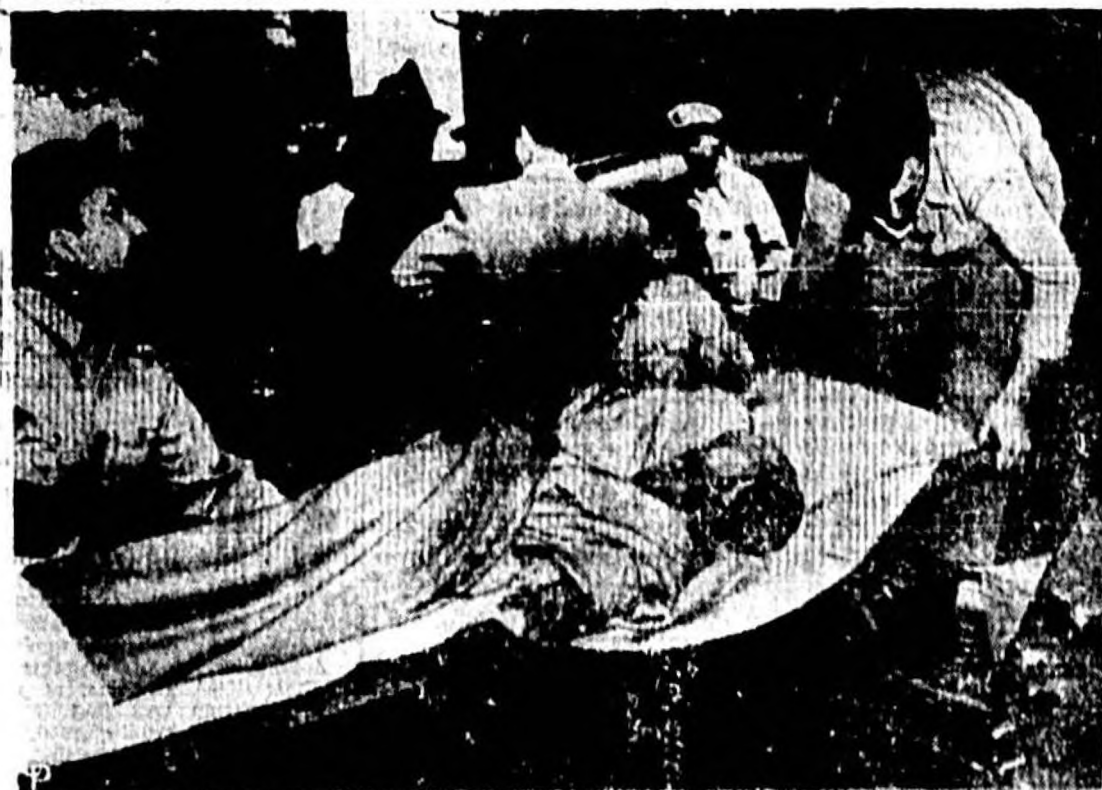
An aged woman is carried on a stretcher to a waiting ambulance of removal to a community hospital. She was one of twenty-five injured when fire swept the Littlefield Nursing Home in Columbus, a suburb of Washington, D.C., three of the elderly women residents of the home perished in the fire. Fire fighting equipment from five nearby communities was used to fight the blaze. The cause of the fire has not immediately determined.