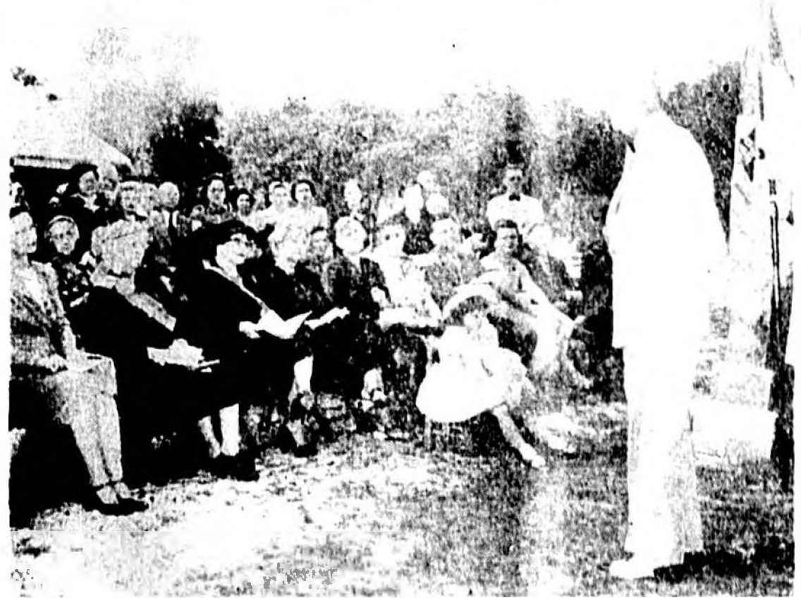
At the unveiling of the monument to the late Hughey, a group of people gathered for memorial services.