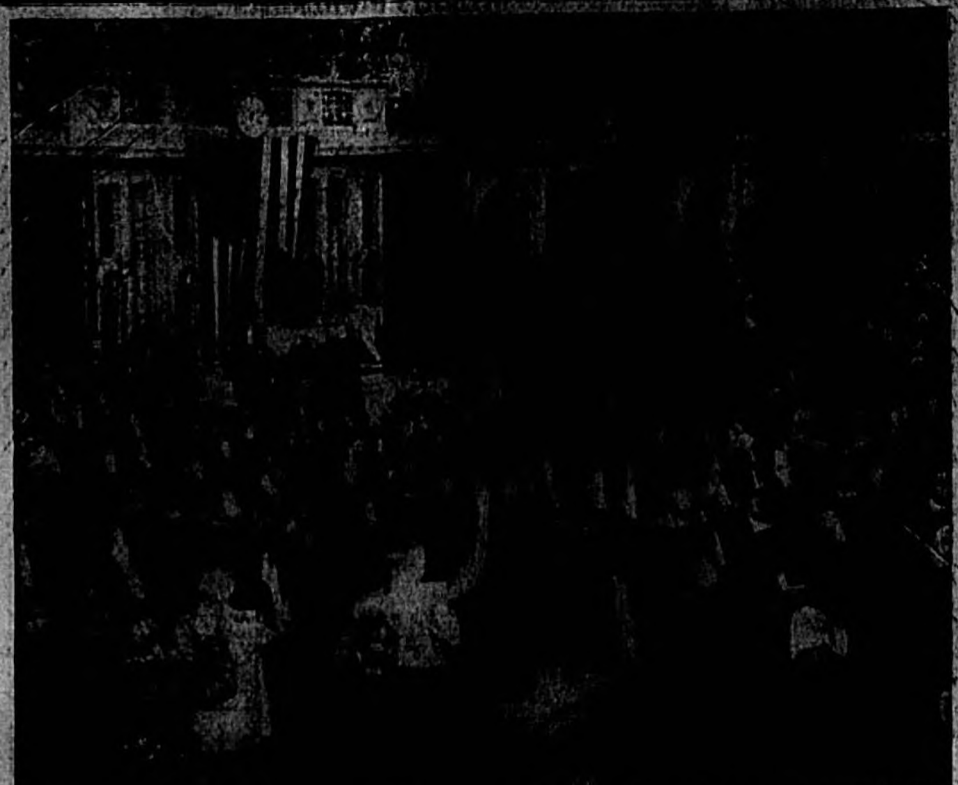
Hands raised in collective oath to support the Constitution under which they have been elected to represent the people, the members of the incoming Congress re-elected for the 75th time in the country's history the drama of self-government. Speaker Bankhead, presiding over the House, may be seen on the rostrum.

The principal countries to be in line of course, are Japan, Italy and Germany.