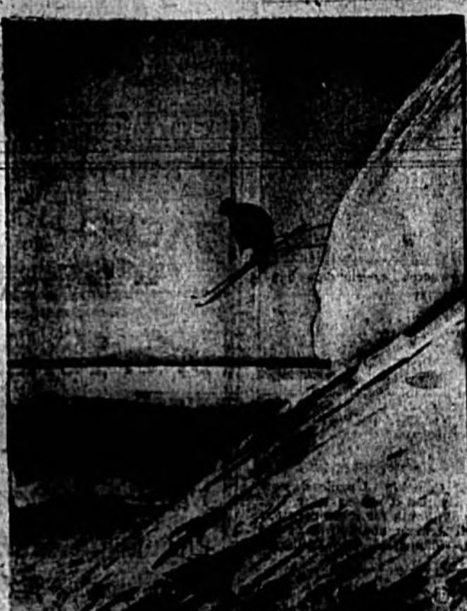
This is just one way which skiers find recreation in the wide open spaces above Timberline Lodge, Mount Hood, Ore. Scenes of America's winter Olympic Games begin April 1-3, the tricky course down the rugged slopes is 2.74 miles long, providing an average drop of 1,076 feet a mile.