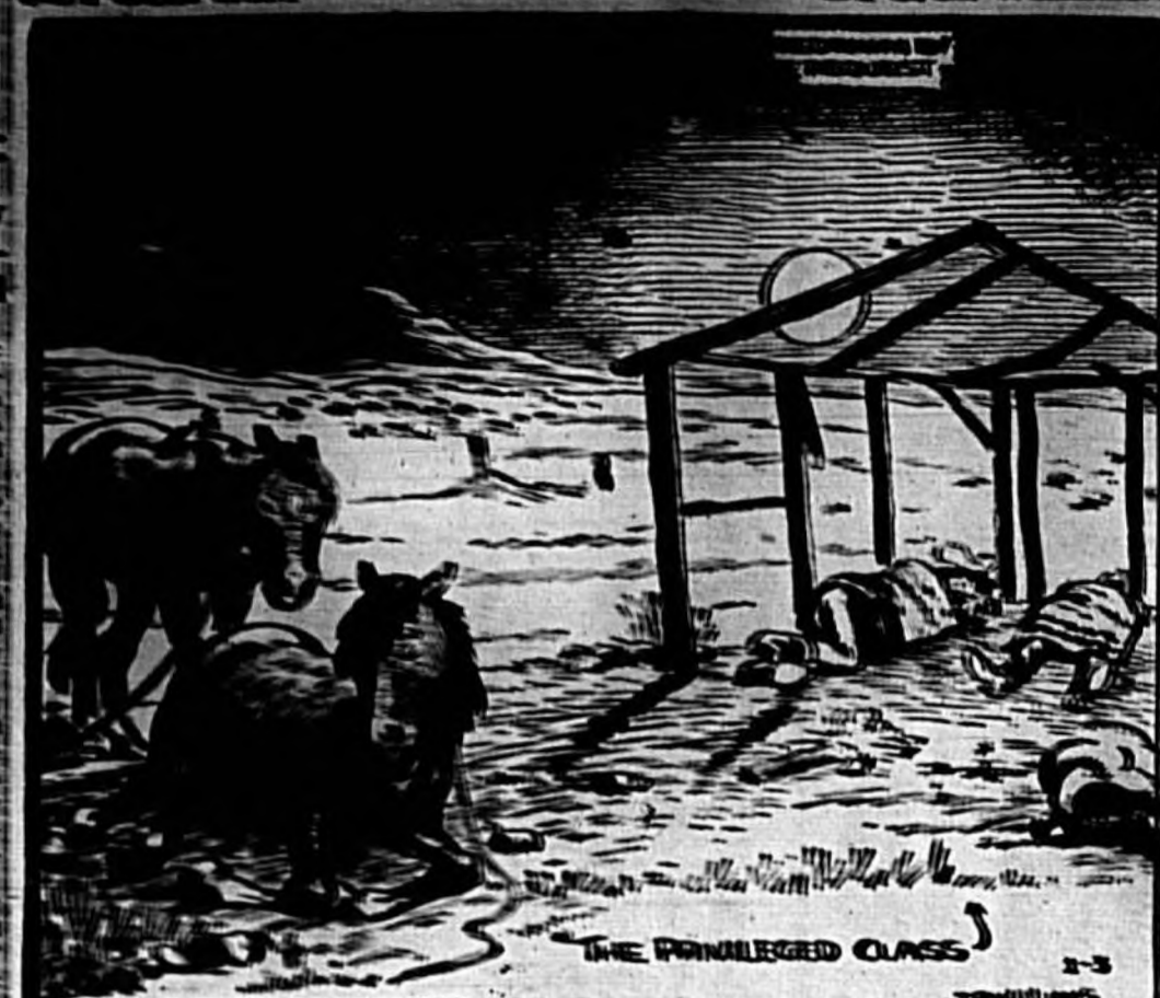
THE PRIVILEGED CLASS

It is the privilege of the few to have a horse-drawn carriage. The rest of the world is left to the motor car.