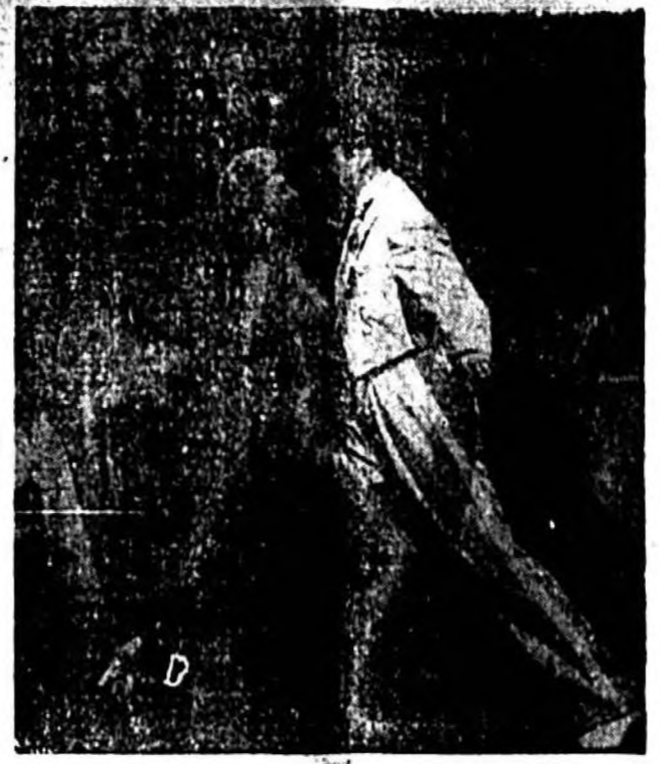
Dancing on top of the world is Cesar Romero, with beautiful Betty Grable in his arms and the strains of Harry James' music in the air. They are starred with John Payne and Carmen Miranda in 20th Century Fox's "Springtime in the Rockies," the buoyant, bountiful Technicolor musical coming Sunday and Monday to the Ritz Theatre. The laugh department is in the zany hands of Charlotte Greenwood and Edward Everett Horton.