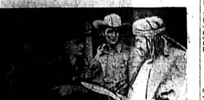
That scatterbrain, Judy Canova, is back again in "Sleepy Time Gal" with Billy Gilbert, Tom Brown and Skip Jones and His Orchestra, showing as part of a big double-bill program at the Ritz tomorrow and Saturday.