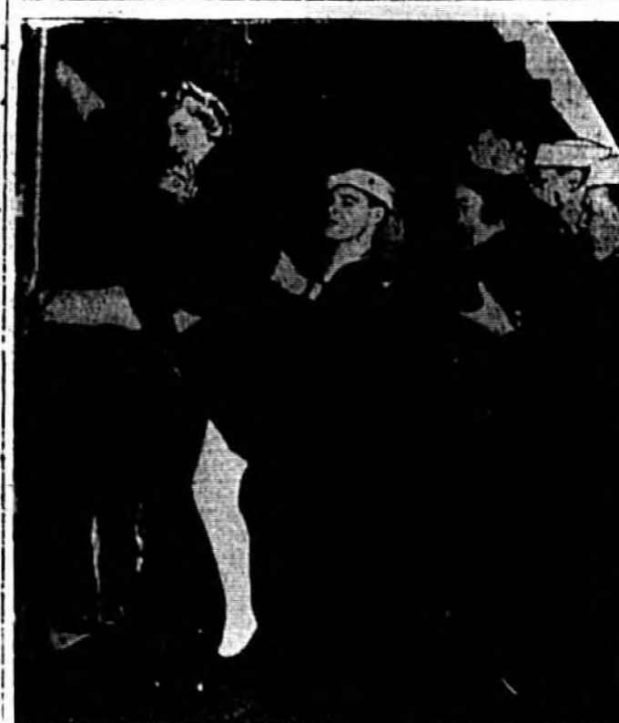
Picture that shows gentlemen as well as fighters, these Hollywood Victory Caravan members...