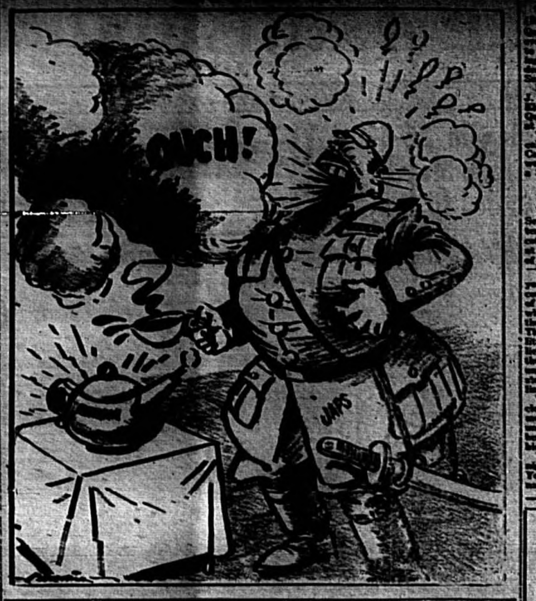
The Standard Forum