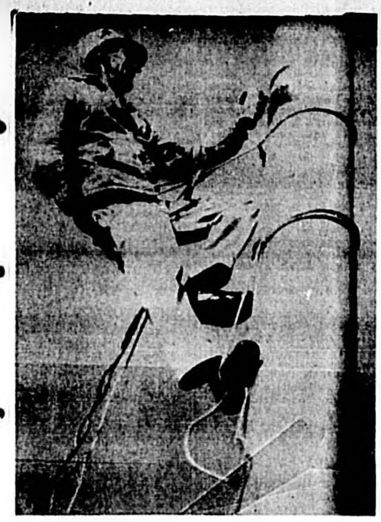
UP IN CHILL AIR - Frank Plankey, professional flagpole painter, gave the City of Sanford pole a "once over lightly" in today's early-morning chill air. Plankey painted the flagpole three years ago.