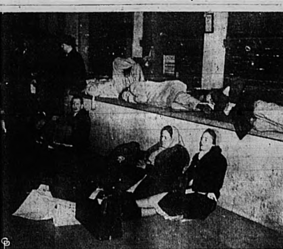
WITH ALL TRAIN SERVICE badly delayed or completely stopped in New York by the record snowfall of 23.4 inches, stranded travelers are pictured above in Grand Central Station as they settled down for long waits, not knowing when their trains would be running. Over 10,000 men and 1,468 pieces of snow-removal equipment were mustered out in a struggle to free the city from the worst snowfall in its history.