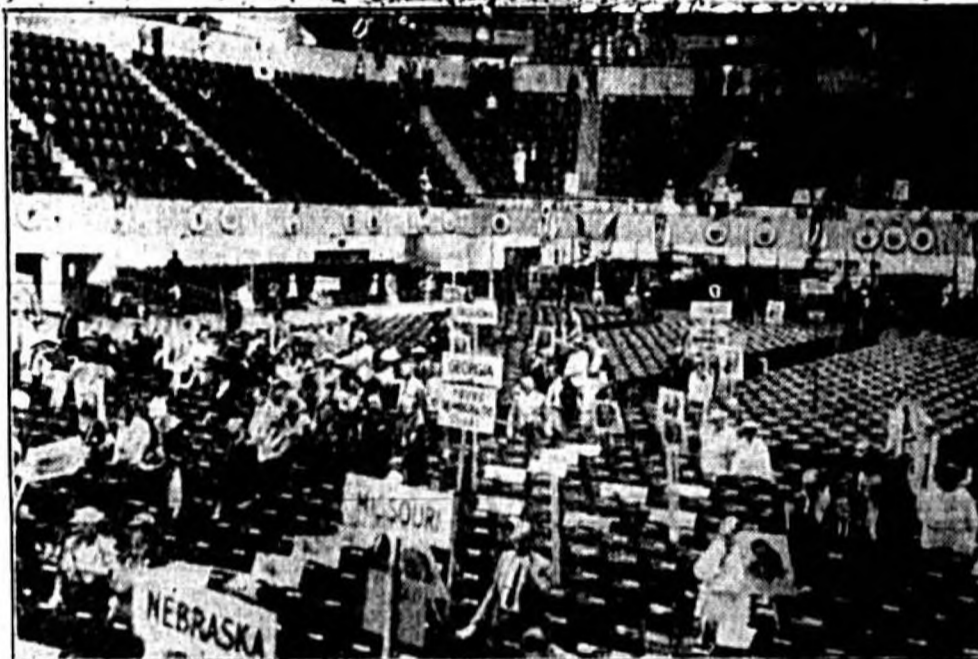
Here is the teeming multitude—of empty seats—at the Democratic national convention when Chairman Robinson rapped for order to nominate Vice President Garner for another term. Delegates demonstrated so long and loudly at the nomination of President Roosevelt the night before that few felt equal to another session of merry-making.