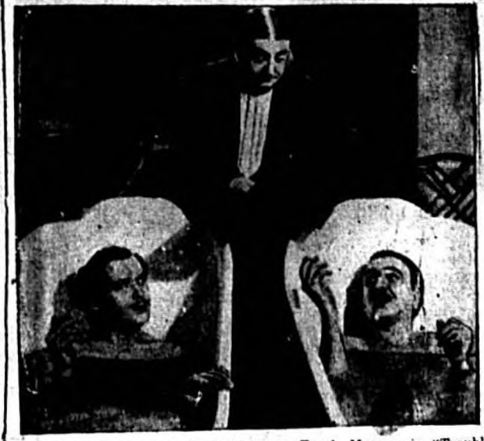
Robert Montgomery, Ivan Simpson, Frank Morgan in "Trouble for Two," playing at the Ritz Sunday and Monday.