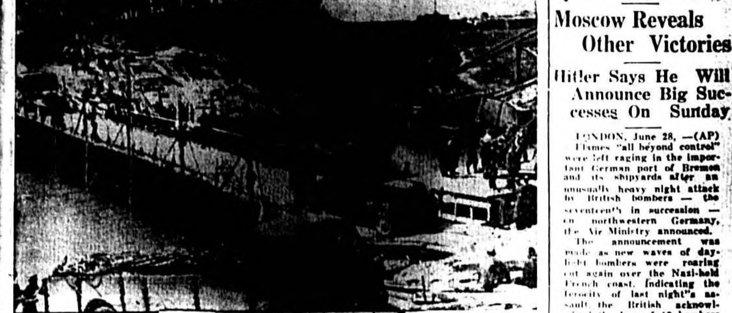
Russian destruction of the frontier bridge and motorized troops already are pushing in background fails to halt the invading German army. Pioneer troops have erected an auxiliary bridge alongside the wrecked one.

Wrecked Russian Bridge Fails To Halt Nazis