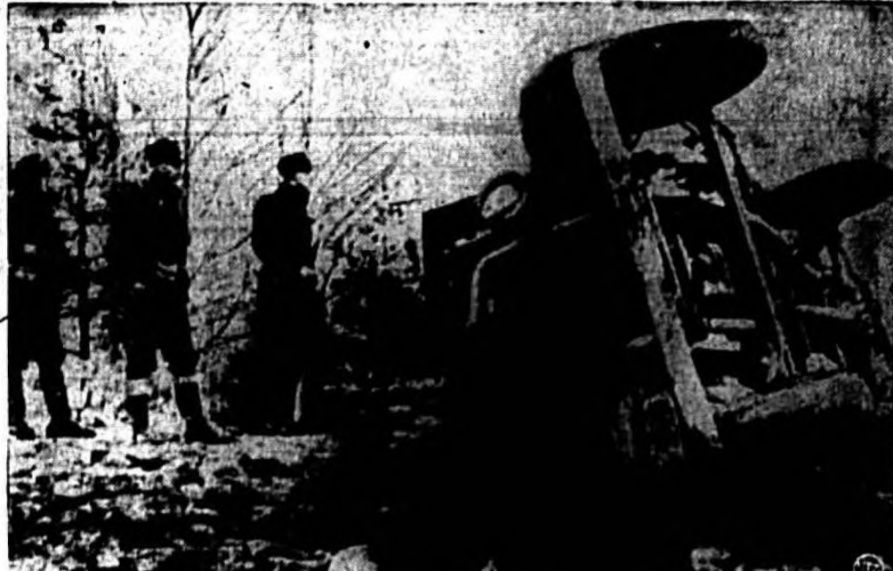
BEHIND A TRUCK overturned as a barricade against the advancing German hordes these three Norwegian soldiers stand guard in the southern part of their country. This picture was radiocast from London.

Many are edged on both skirt and bodice with a fine pleated frill. Next comes a long procession of gowns of net, point d'esprit, mar-