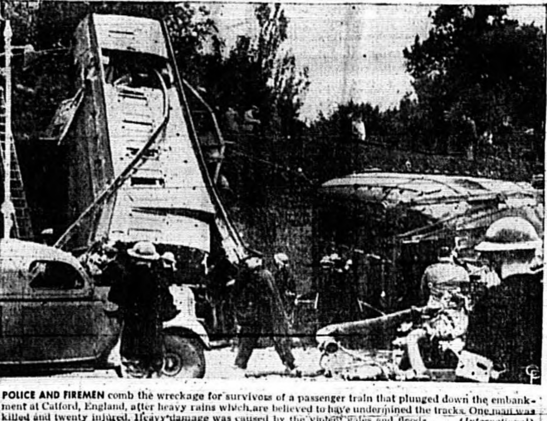
POLICE AND FIREMEN comb the wreckage for survivors of a passenger train that plunged down the embankment at Colford, England, after heavy rains which are believed to have undermined the tracks. One man was killed and twenty injured. Heavy damage was caused by the violent gales and floods.