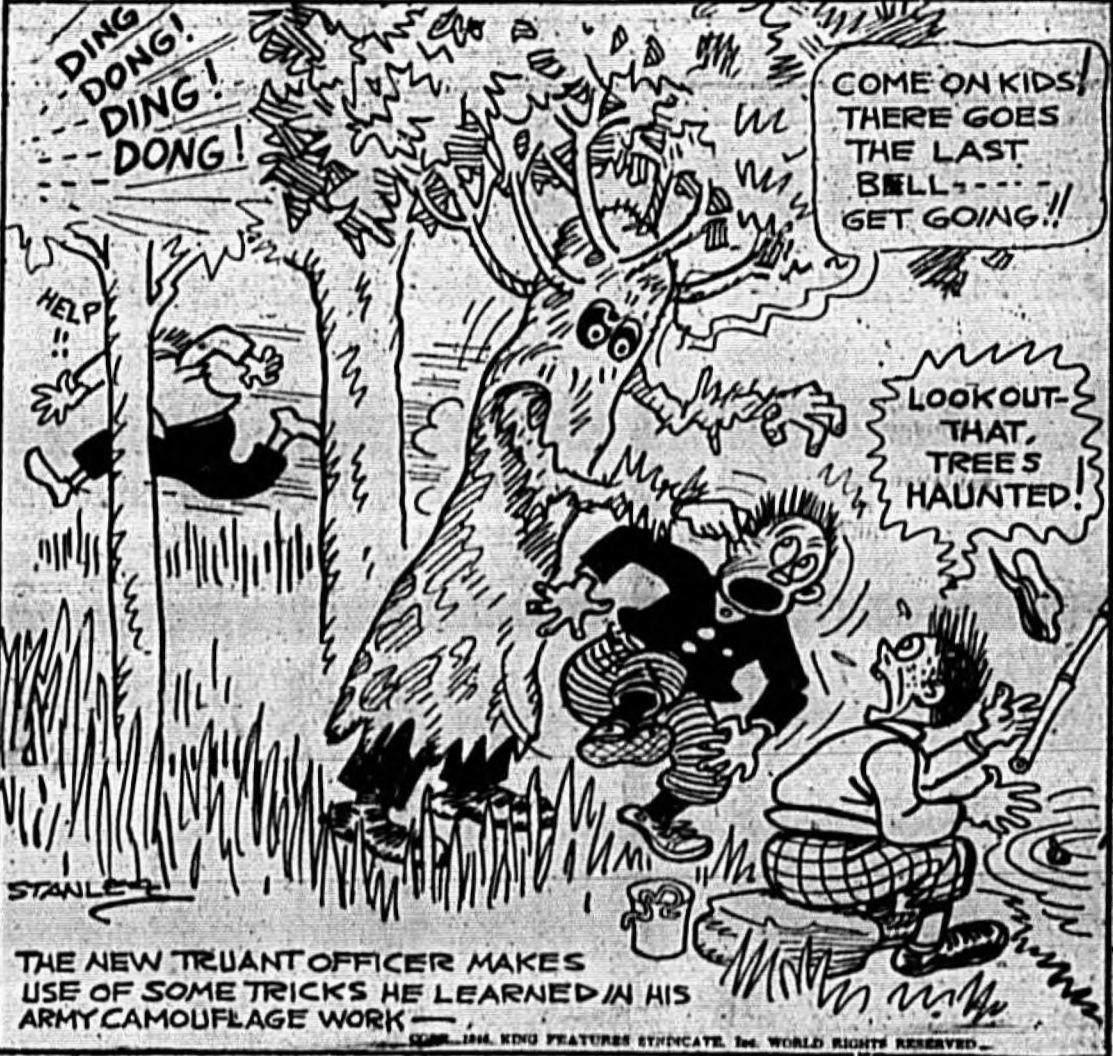
THE NEW TRIJANT OFFICER MAKES USE OF SOME TRICKS HE LEARNED IN HIS ARMY CAMOUFLAGE WORK.