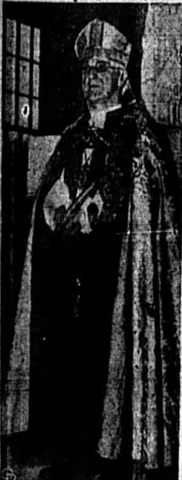
THE MOST REVEREND Geoffrey Francis Fisher, Archbishop of Canterbury, is shown after he had delivered a sermon at the Cathedral of St. John the Divine in New York City. The Primate of All England said that the weakness of the world is its lack of faith.

The population of Texas increased 287 percent between 1890 and 1940.