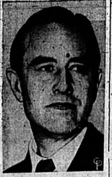
AMBASSADOR to the Court of St. James, W. Averell Harriman has been named by President Truman to succeed Henry A. Wallace as Secretary of Commerce. Harriman was envoy to Soviet Russia during the late war.