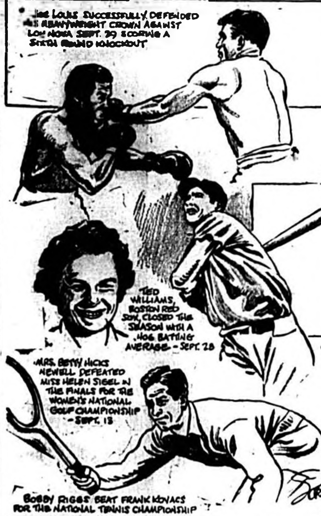
BOBBY FISKE BEAT FRANK KNOX FOR THE NATIONAL TENNIS CHAMPIONSHIP