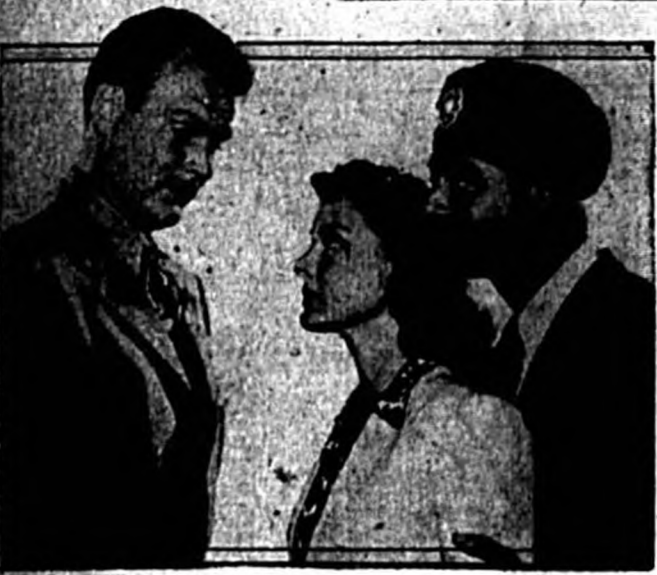
Leif Erickson does his best to break up the romance between Florence Rice and Alexander D'Arcy in "THE BLONDE FROM SINGAPORE," which will be shown next Tuesday at the Ritz as part of a double program.