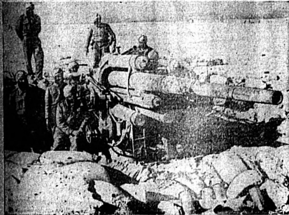
Turbaned Indian troops examine a large Axis gun captured in the British desert offensive. Axis forces in Libya are reported in full retreat with the Imperial troops close at their heels.