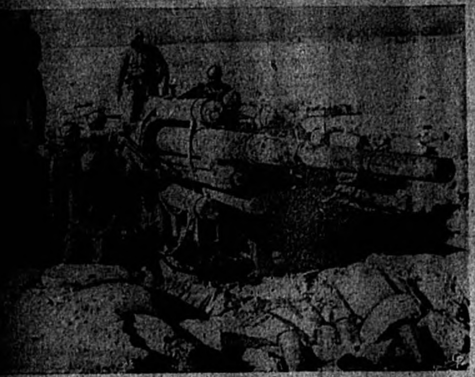
Indian troops examine a large Axis gun captured in the British desert offensive. Axis forces in Libya are reported in full retreat with the Imperial troops close at their heels.