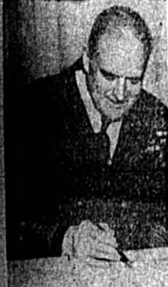
Adm. Sir Charles Little

United States members of the newly created Anglo-American War Council are shown leaving the White House in Washington, D. C. Left to right: General Henry H. Arnold, chief of the Army Air Corps; Secretary of War Henry L. Stimson; Admiral Harold R. Stark, chief of Naval Operations; Secretary of the Navy Frank Knox; General George C. Marshall, Army Chief of Staff; and Admiral Ernest J. King, new commander of the United States fleet.