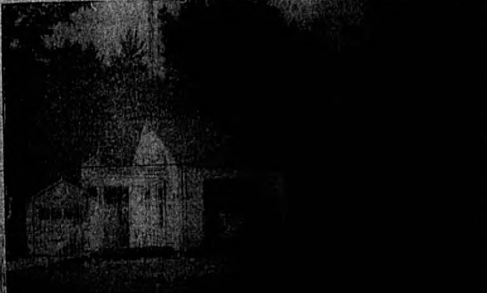
HOUSE OF TODAY AND TOMORROW Plywood-and-glass houses being erected almost overnight in many cities are a result of the new building technique which is revamping home building practices. The structure shown is a prototype of a new type of house which has livable interior. Yet it is erected from factory-made panels for speed and economy.