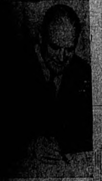
Gen. Sir Charles Little Chief of the British war board in London is shown in Washington. He is expected to plan unified operations against the Axis.