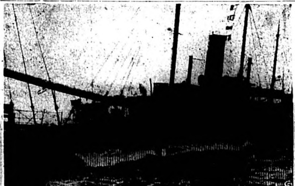
The United States freighter Absaroka, 5,698 tons, lumberladen ship threw off tons, limps into port, victim of a torpedo attack some of her cargo when hit and made port by a Japanese submarine six miles off the California coast. The lumberladen ship threw off tons, limps into port, victim of a torpedo attack some of her cargo when hit and made port by a Japanese submarine six miles off the California coast. One crew member was killed.