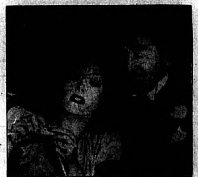
Gloria Swanson decides that being a happy wife is much better than being a good actress. Adolphe Menjou heartily agrees in "FATHER TAKES A WIFE." John Howard, Florence Rice, Desi Arnaz and Helen Broderick also appear in this comedy, showing next Tuesday at the Ritz.