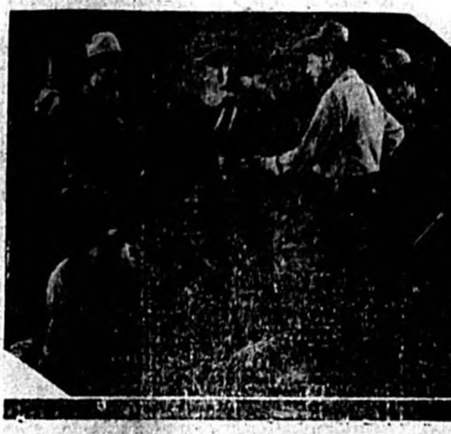
Gene Autry and Smiley Burnette are ganged by a band of badlands bandits in "SIERRA SUE," newest adventure of these ridin', romancin', roguish Smiley Burnette, Fay McKenzie and Frank Thomas have the other important parts in the picture, coming next Friday and Saturday to the local Ritz.