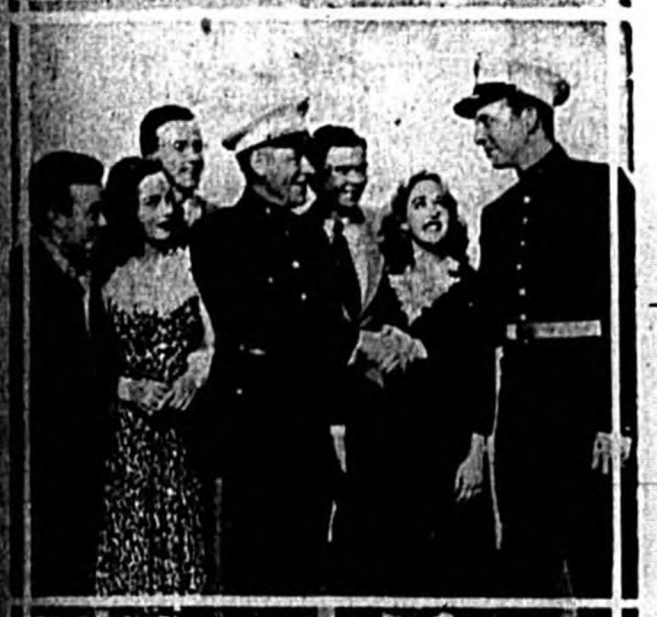
The Marines have the situation well in hand in this scene from "DOWN IN SAN DIEGO," one of the season's entertainment triumphs coming to the Ritz next Friday and Saturday. Ray McDonald, Bonita Granville, Henry O'Neill and Leo Gorcey have the leading roles.