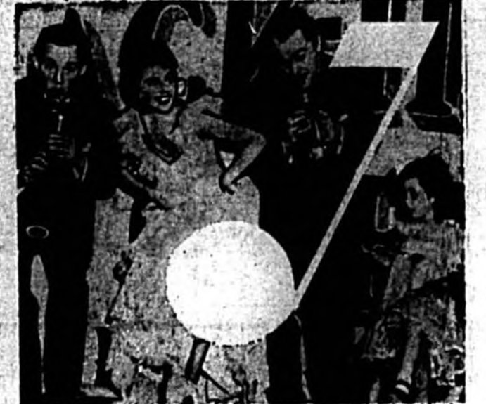
Bing Crosby, Mary Martin, Brian Donlevy and Carolyn Lee in a bit of syncopation in a scene from "BIRTH OF THE BLUES," newest screen musical sensation! This big hit, in which Eddie (Rocheater) Anderson heads an enormous supporting cast, will be shown next Wednesday and Thursday at the Ritz.