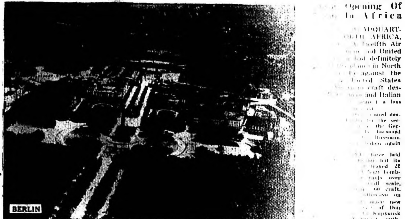
Berlin, Before R.A.F. Raids

For the first time since Nov. 7, 1941, a large force of R.A.F. bombers... super "blitz-busters" and tens of thousands of bombs Saturday night and Sunday.