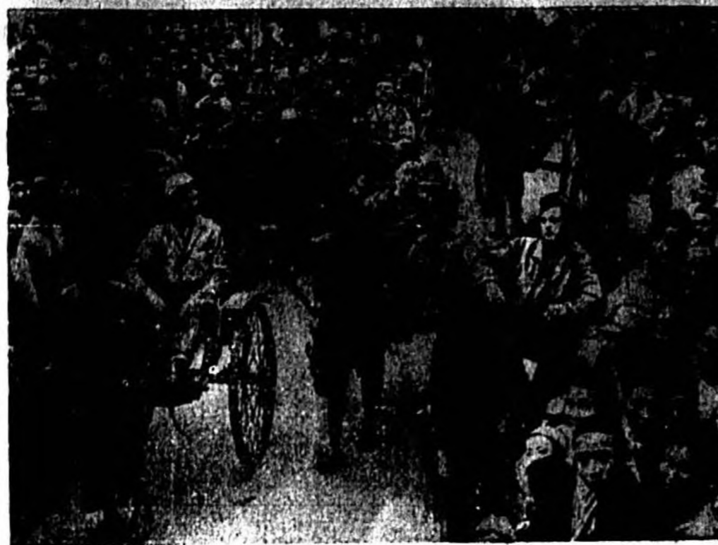
A group of U. S. soldiers stationed somewhere in China, create quite a fuss among the town's inhabitants as they go for a rickshaw ride through a street near their base. Throngs of curious Chinese line the street to watch the Yanks as they roll along. A number of the Chinese are just as interested in the cameramen recording the scene.