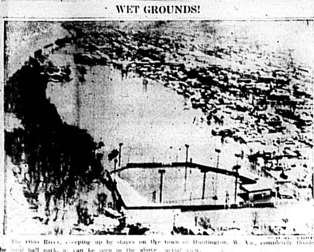
The Ohio River, creeping up by stages on the town of Huntington, W. Va., completely flooded the local ball park, as can be seen in the above aerial view.

SHANGHAI (AP)—Assassins today shot Chien Hwa, head of the Japanese-controlled Chinese Press censorship office, and he was not expected to live.