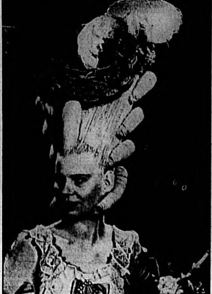
TOPS IN TONSORIAL TOPIA is this towering coiffure awarded first prize among historic "monuments" entered in International Hairdressing competition in Paris. Sausage curls flanking the sides and feathered top stop the pompadour in the suave style of Louis XV's court.