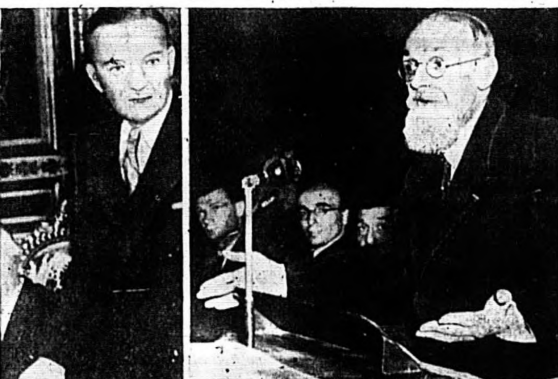
IT APPEARS THAT THE COMMUNIST PARTY IN FRANCE won a huge seat lead over its nearest rival, the Popular Republican Movement (MRP), in the nationwide election of deputies to the Fourth Republic's first National Assembly. Francisque Gay (right), leader of the Popular Republican Movement (MRP), is pictured as he addressed a group during the campaign. Provisional President of France Georges Bidault (left), is shown as he presided at the opening session of the National Press Conference in Paris.