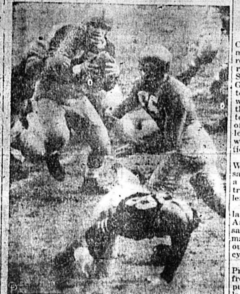
The Fighting Face Of Tucker

Truman Says Methods Of Agreement Will Be Worked Out As Congress Convenes... More Than 1,000 Jews Allowed To Enter Palestine