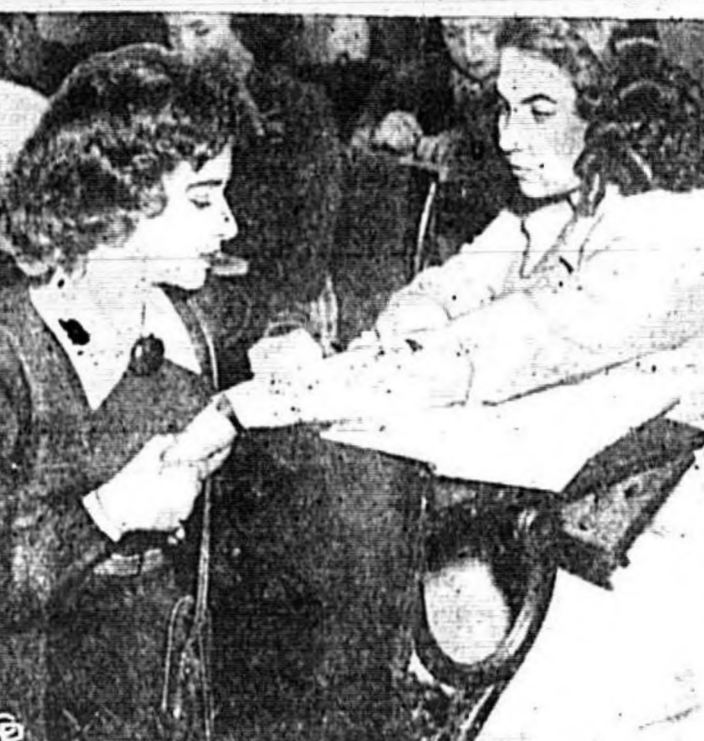
CHILDREN IN SCHOOL AT THE ...