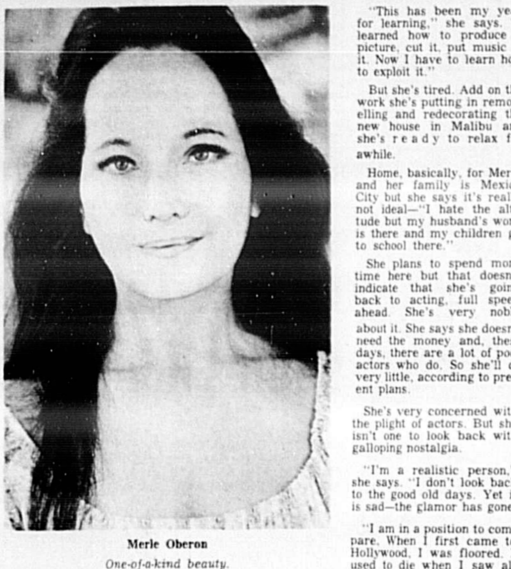
Merle Oberon One-of-a-kind beauty.

HOLLYWOOD—(NEA)—Many things change in this world but it's nice to report that Merle Oberon still looks Merle Oberonish. She says she was a movie star when she was 15 "and I think that was just because of my unusual looks." Now that she is 56—she is one of the movie veterans who isn't afraid to list her birthday.