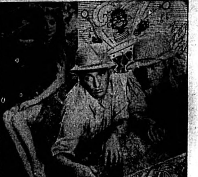
CONCEDE TO be the best dish of entertainment they have ever dispensed, "The Road to Zanzibar," starring Bing Crosby, Bob Hope and Dorothy Lamour will hold forth for two most-provocative, melodious days at the Ritz Theater tomorrow and Monday.