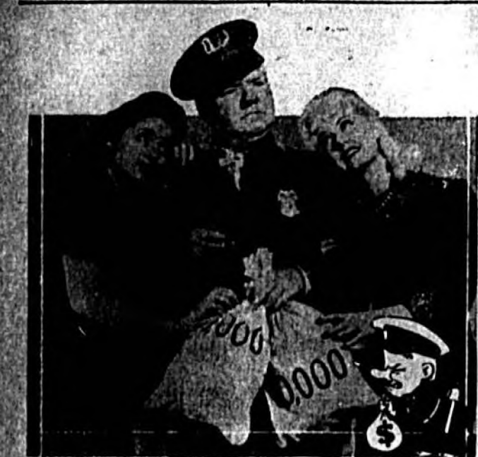
Twenty-five years after his initial motion picture appearance, W. C. Fields is starring in what he considers the greatest picture of his career, "The Bank Dick," which will be shown next Friday and Saturday at the Ritz.