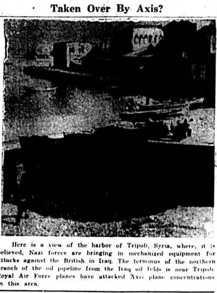
Taken Over By Axis? Here is a view of the harbor of Tripoli, Syria, where, it is believed, Nazi forces are bringing in mechanized equipment for attacks against the British in Iraq. The terminus of the northern branch of the oil pipeline from the Iraq oil fields is near Tripoli. Royal Air Force planes have attacked Axis plane concentrations in this area.