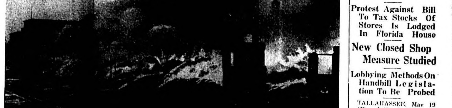
Firemen pour tons of water on the blast as flames roar through the Port Richmond section of Philadelphia, destroying homes and factories, with damage estimated at $5,000,000.