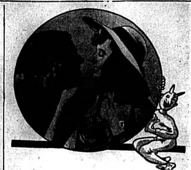
Jean Arthur and Robert Cummings are shown above in a scene from "The Devil and Miss Jones" booked for benefit performances under the auspices of the Sanford Junior Woman's Club next Wednesday and Thursday at the Ritz Theater. A new March of Time, "Crisis in the Atlantic" is also on the program.