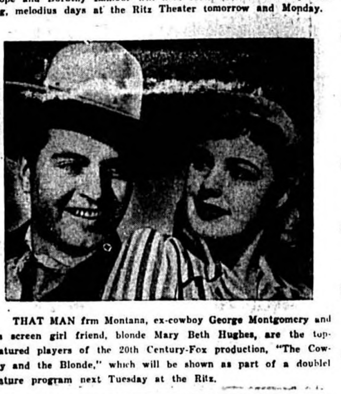
THAT MAN from Montana, ex-cowboy George Montgomery and his screen girl friend, blonde Mary Beth Hughes, are the top featured players of the 20th Century-Fox production, "The Cowboy and the Blonde," which will be shown as part of a double bill program next Tuesday at the Ritz.