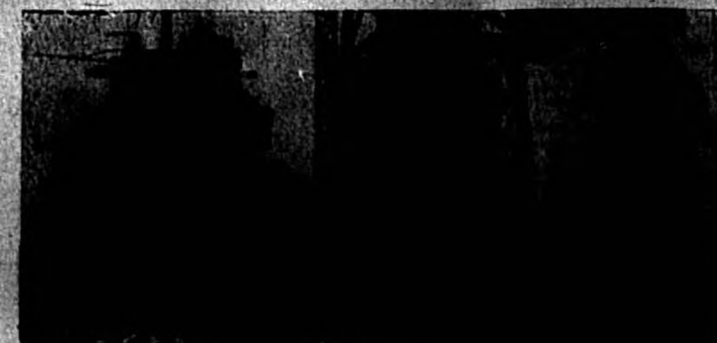
The new $1,000-ton, $70,000,000 battleship U. S. S. Washington is commissioned in the Philadelphia Navy Yard. Completed 17 months ahead of schedule, the new vessel brings Uncle Sam's capital ship list up to 11. Secretary of the Navy Knox, officiating, declared the U. S. is building the greatest navy ever conceived.