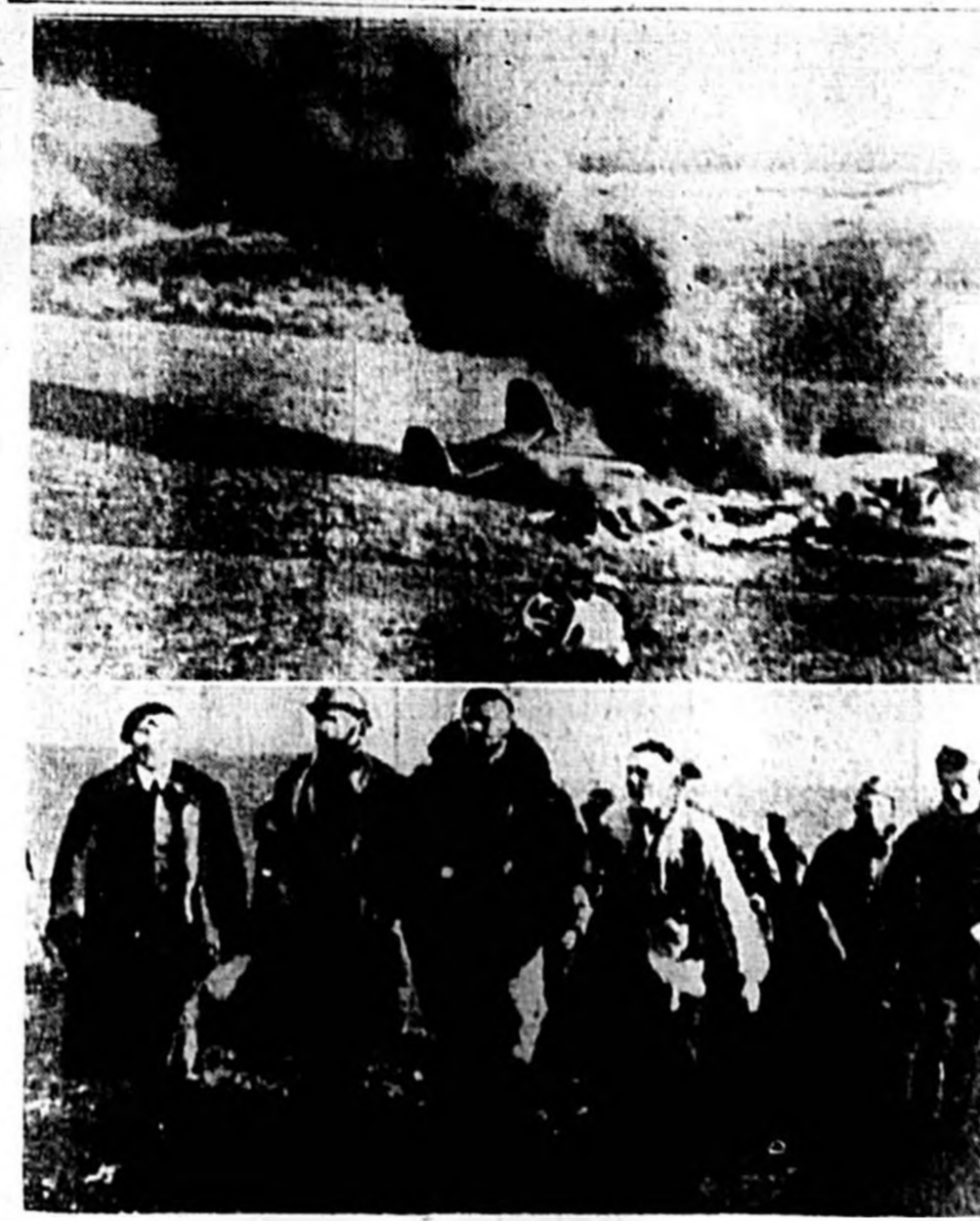
A German Dornier 17 Bomber Blazes after being brought down by anti-aircraft fire.

WASHINGTON, Jan. 16.—(AP)—A German Dornier 17 Bomber Blazes after being brought down by anti-aircraft fire.