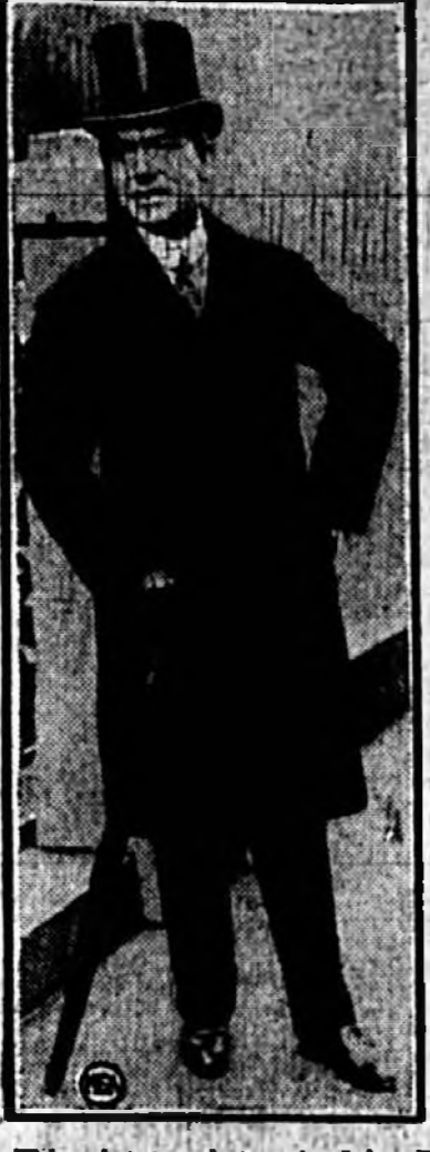
This latest photo of John D. Rockefeller, Jr. was snapped when he appeared at the Rockefeller church for Easter services.