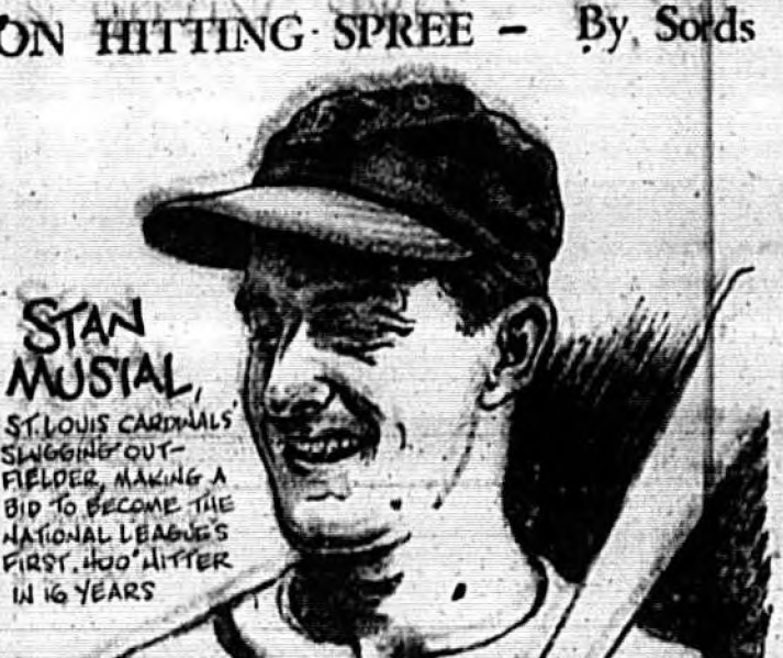
STAN MUSTAL ST. LOUIS CARDINALS STAGGERING OUT-PEPPERING MAKING A BIG 10 RECORD IN NATIONAL LEAGUE'S FIRST 100 ATTEMPTS IN 9 YEARS