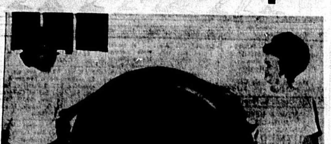
HOUSE OF Antiques displays many ancient and unusual items, and will be shown by Dolly Foggin and Helen Cain.

An unusual and delightful way to spend a leisurely afternoon is to browse through the lovely House Of Antiques, located at the Super Trading Post on Highway 17-92 across from the Sanford Plaza. Open only two weeks, House Of Antiques is planning its grand opening for sometime in January. But, in the meantime, everything from key wind watches to T Model Ford may be found. In one room of the house, a beautiful hand carved bed with a legendary history is set up for the visitors to admire. Over 140 years old, the bed required over two years to carve with an original cost of $3500. The bed has appeared in a number of Warner Brother silent movies. Bill Cain and Forrest Foggin, owners of the Super Trading Post four months, said they came into possession of the bed when they purchased the Trading Post and have