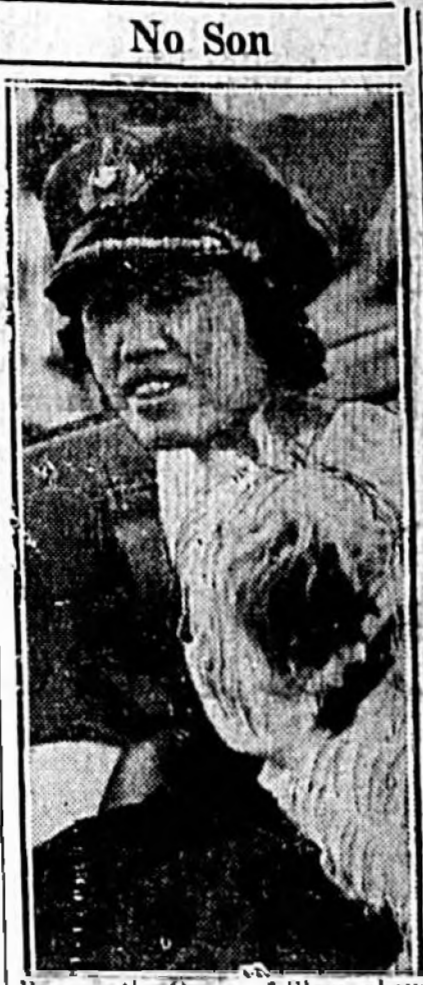
Frank J. Clark, U.S. Representative, is seen in a recent photograph.

The Sanford Herald today begins the publication of a series of short sketches giving important features of the "City Substantial" under the caption "Sanford Facts." The features, first published by The Herald last year, met with unusual interest and proved a source of much information, not only to local citizens, but also to Sanford visitors. Beginning today one sketch will be published daily for an indefinite period. Each day some salient feature of the city will be briefly but accurately described. The series begins with a resume of water transportation facilities available here. In announcing the publication again of "Sanford Facts," The Herald calls attention to the fact that in each case the subject will be brought up to date so that information supplied in this connection will contain the latest data.