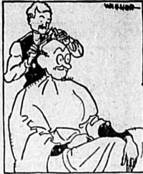
Th' feller who drinks hair tonic will never live to see his hair wavin' over his grave.