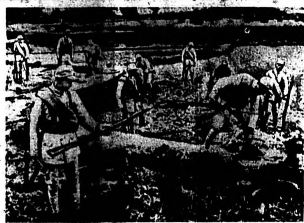
Chinese soldiers are shown collecting Japanese material after the Japs suffered a major defeat here more than 21,000 men, including the Jap commander Kato.