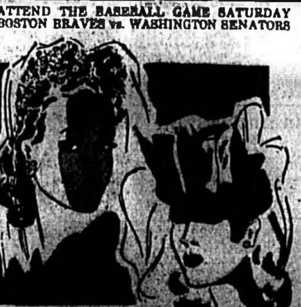
ATTEND THE BASEBALL GAME SATURDAY BOSTON BRAVES vs. WASHINGTON SENATORS

By AGNES WELLS A Bit, E. P. review of the life of Arthur Brisbane, a prominent journalist and politician. His life was a testament to the power of the press and the influence of a single man in shaping public opinion.