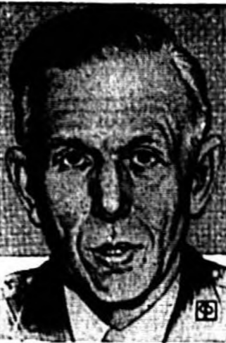
Gen. George C. Marshall Chief of staff, United States Army