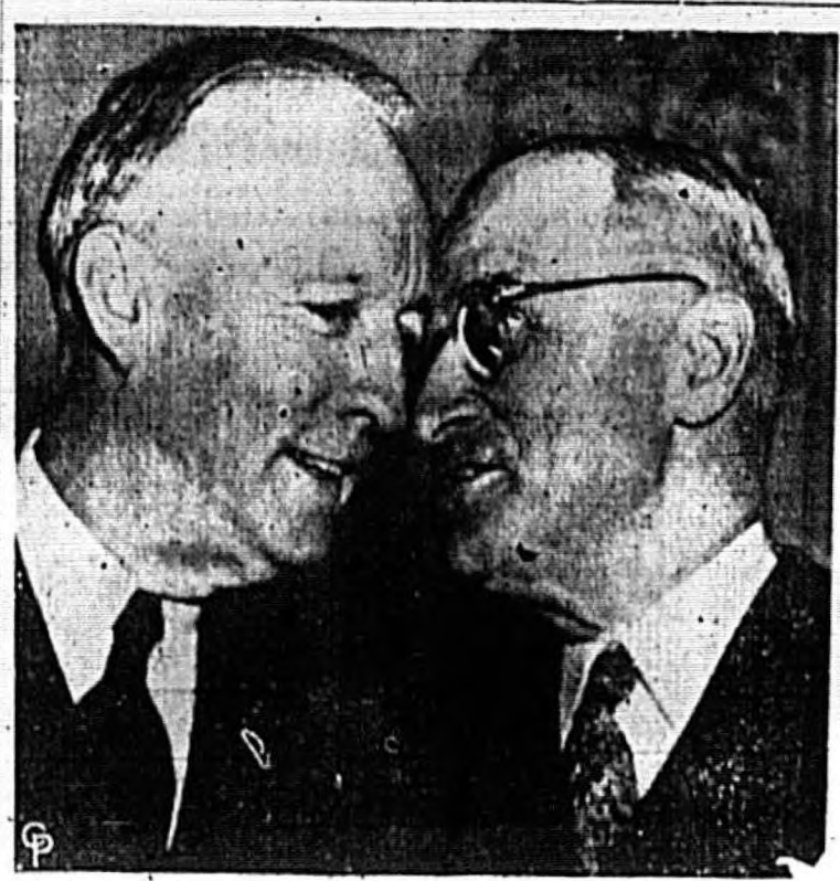
WHEN THE NINE MEMBERS of the U. S. Supreme Court called on President Truman at the White House, an alert photographer asked for a "little different" pose. The President obliged and here is the result. It shows the Chief Executive and Justice Hugo L. Black with their heads together, as they engage in conversation.