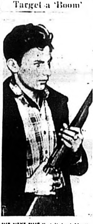
Target a 'Boom'