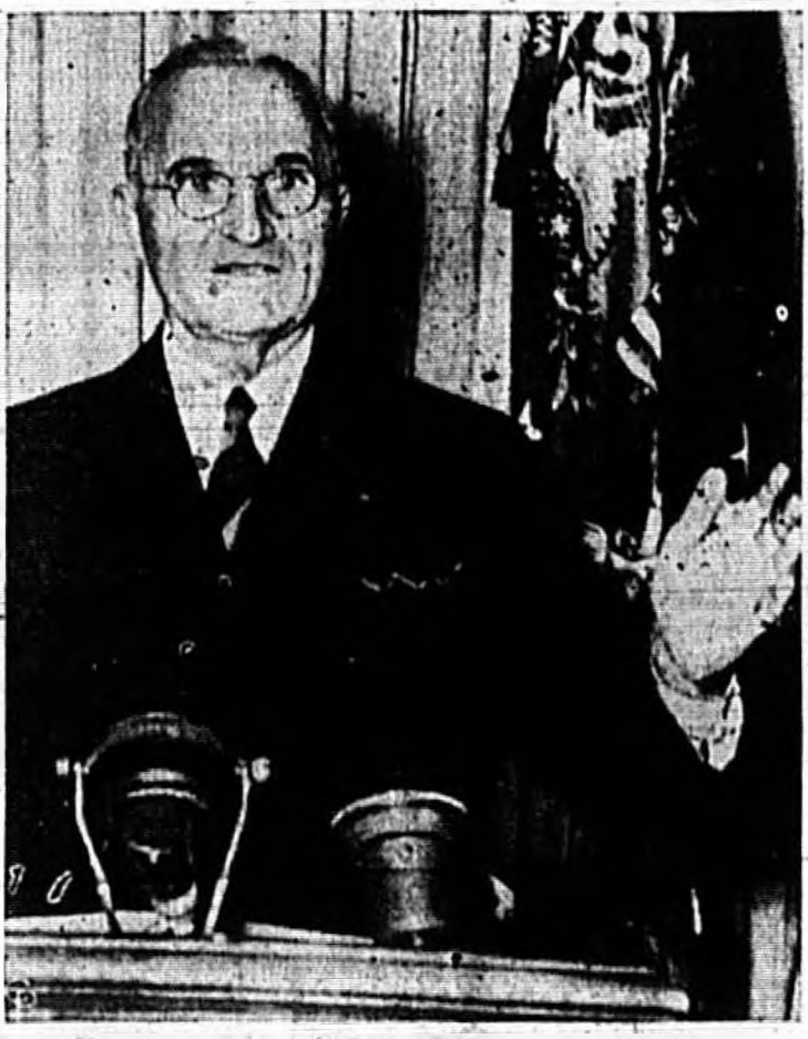
PRESIDENT Harry S. Truman, in a radio address from the White House, tells the nation that he has ordered removal of government price controls from meat, livestock, feed and all foods derived from livestock. The President said this action was the only remedy left to cure the meat shortage, and was taken after deep thought.