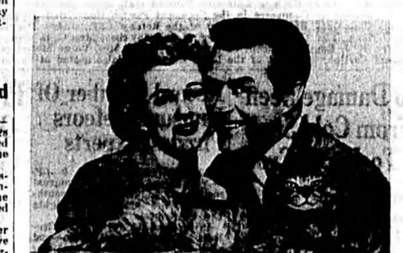
Rhubarb, the cat is indifferent to Jan Sterling and Ray Milland posing romantically in Paramount's comedy "Rhubarb," showing Sunday and Monday at the Ritz Theater screen.