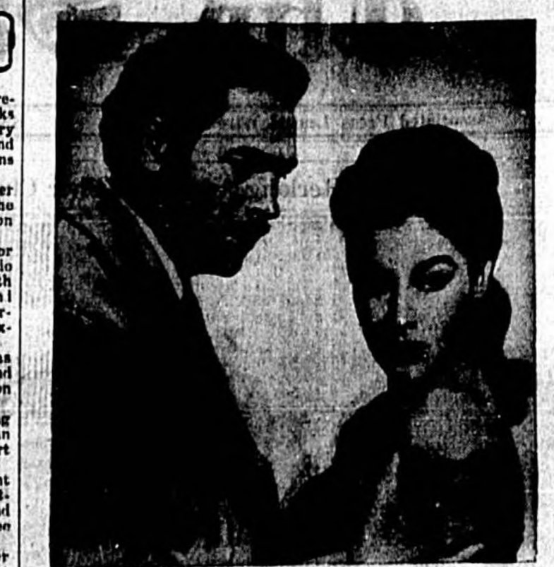
Howard Keel and Ava Gardner in a scene from the picture "Show Boat" showing at Movieland Ride-In Theater Sunday and Monday.