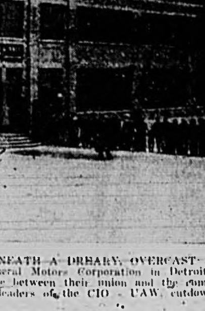
BENEATH A DREARY, OVERCAST SKY, strikers line up outside the Gear and Axle plant of the General Motors Corporation in Detroit while waiting to receive their last paychecks until the dispute between their union and the company is settled. Snow and temperatures in the city today are in the 20's according to leaders of the CIO-UAW, outdone the number of workers on picket lines at Michigan plant.