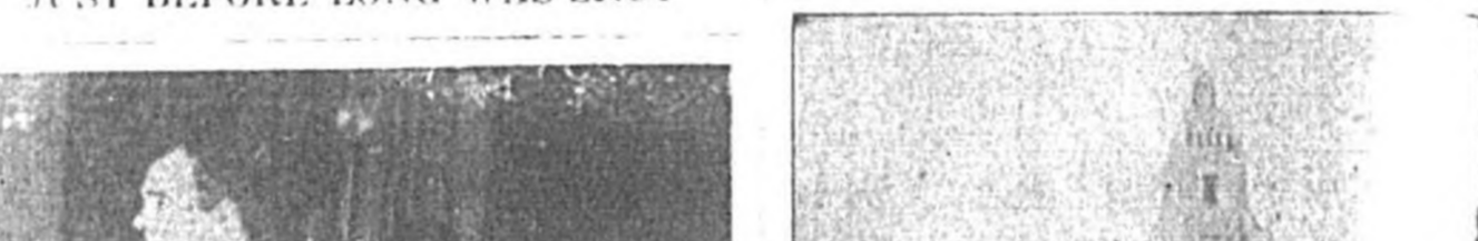
Portrait of Huey Long in a military-style uniform, wearing a hat.