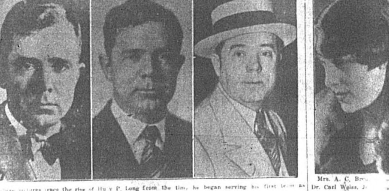
Portrait of Huey Long in a suit, looking directly at the camera.