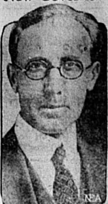
Oklahoma now is under the leadership of this man, Henry S. Johnson. He has just been sworn in as governor.

When King George was opening parliament he said the warships were being sent to China as a token of friendship. No wonder the Prince fell over his sword!