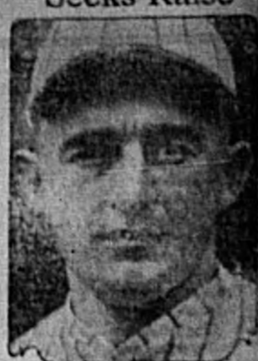
Frankie Frisch, traded to St. Louis for Rogers Hornsby, refuses to sign unless given a substantial increase in salary. He is said to have received $18,000 from the New York Giants last season.