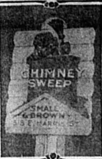
A sign that gets a laugh ought also to get the business, the chimney-sweeping firm of "Small & Brown" figured down Savannah, Ga., way. So the youthful workers devised this one.