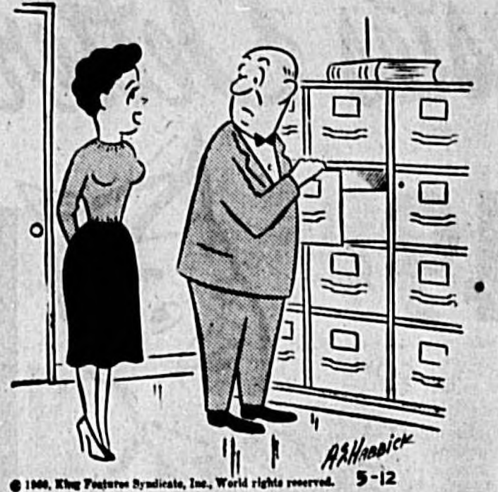
© 1960, King Features Syndicate, Inc. World rights reserved. 5-12 "I threw everything out. I like to start fresh on a new job."