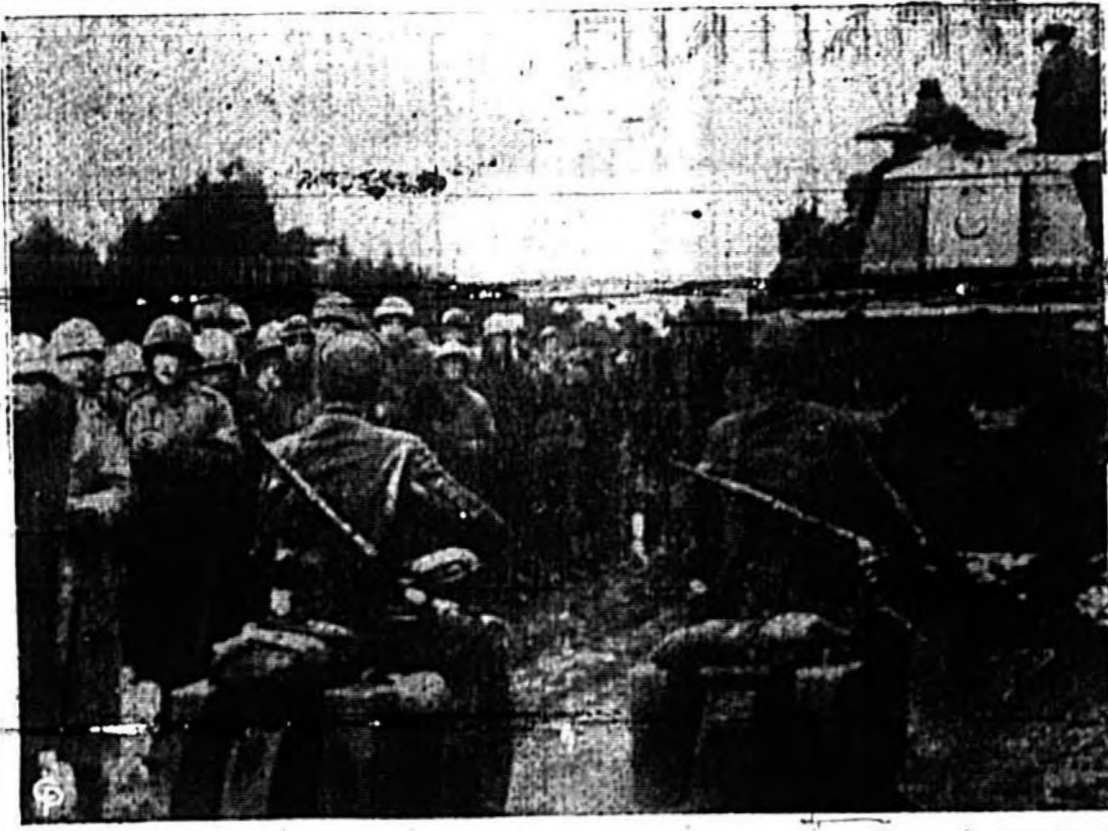
AMERICAN SOLDIERS OF THE FIRST ARMY captured by the Germans following their breakthrough in Belgium are marched past Nazi armored equipment heading for the battlefield. Note that the faces of the OIs have been blacked out from the picture by the army censors. This photo was taken from a roll of captured German film. This is an official U. S. Army Signal Corps Radiophoto. (International Soundphoto)

Waiting For a Sail The Modern Merchant Doesn't wait for SALES HE ADVERTISES