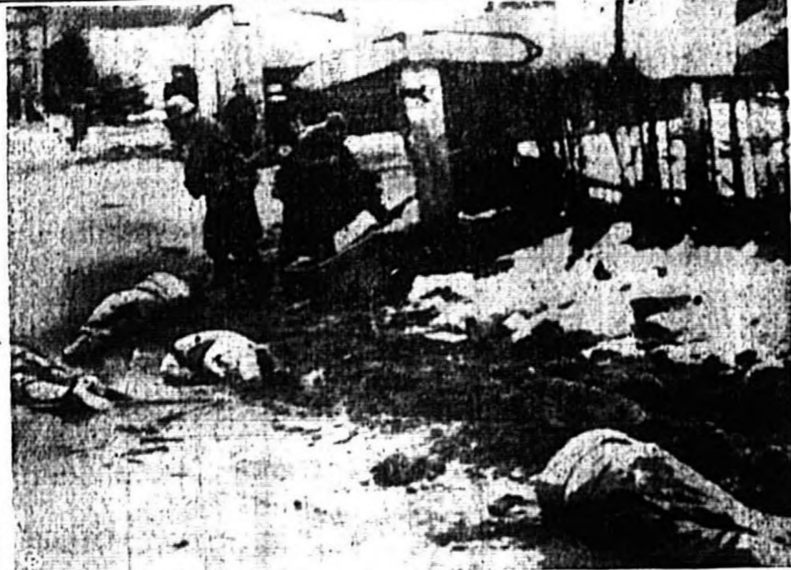
THIS PHOTO, taken from a roll of captured German film, shows four Yanks of the First Army lying on a road somewhere in Belgium. They valiantly gave their lives to stem the enemy breakthrough staged by Von Rundstedt. German soldiers are in the background. Note that the two dead Yanks on the left have been stripped of their shoes. Also note censored signpost.