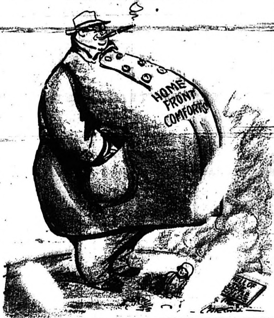
IS IT ALL-OUT WAR? NEW YORK HERALD TRIBUNE

The high level of our national health in this year is clearly indicated by the continued low level of the death rate, says the Metropolitan. "For the country as a whole the 1944 civilian death rate will be slightly lower than that of the preceding year. This is confirmed by the mortality records of the Metropolitan Life Insurance Company."