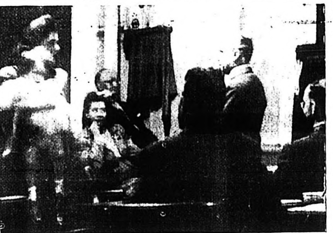
FOR A DRAMATIC MOMENT in a Los Angeles courtroom, film comedian Charlie Chaplin stands facing Juror...