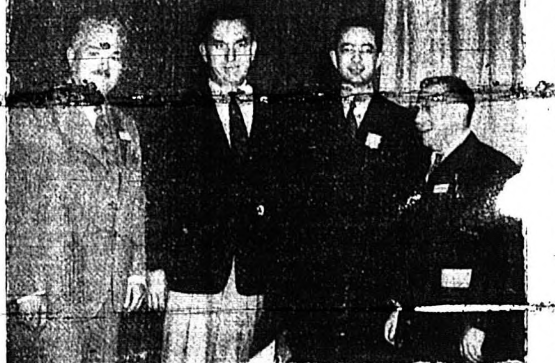
Officers elected to serve the Florida Press Association during the winter year at the recent convention held at Silver Springs...