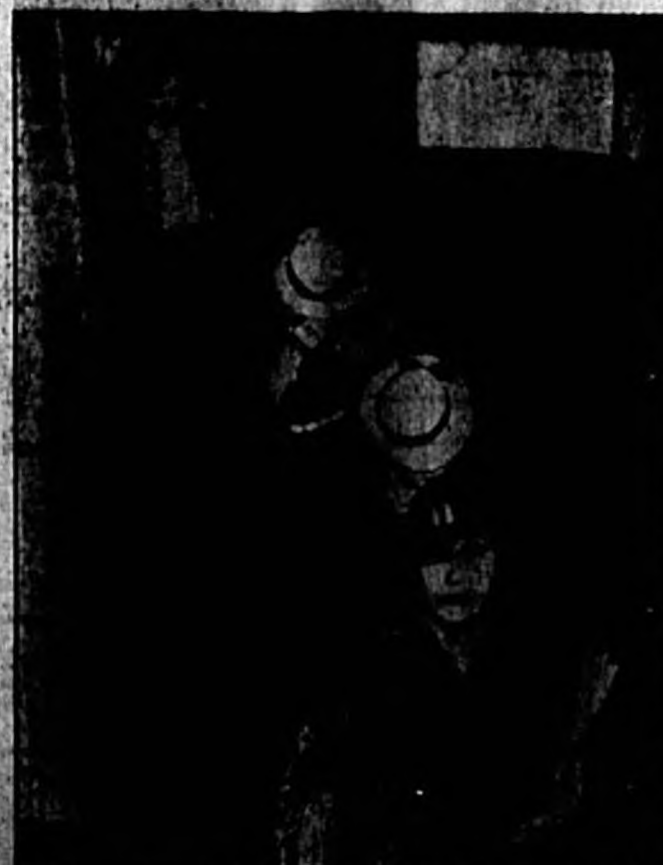
When the vice trial resumed following a police raid on the New York City district, a young girl, who was a witness in the case, was shown in the courtroom. She was the only girl in the courtroom.