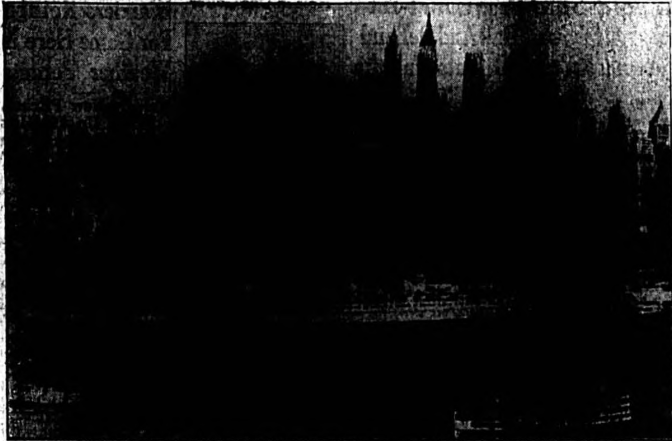
This striking photograph from an airplane shows the gigantic British liner Queen Mary steaming to her berth up the North river past the spires of lower Manhattan. Her graceful bulk makes the New York skyscrapers appear little. Completing her maiden trans-Atlantic voyage, the Queen Mary sailed by a fraction of an hour to beat the speed record of the French Normandie on her first trip to New York.