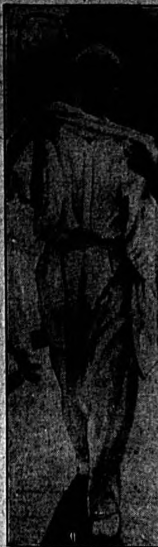
After defeating Wilmer Allison and throwing the United States out of the Davis Cup competition, Captain Jack Crawford of the Australia team mops his brow and leaves the Philadelphia courts.