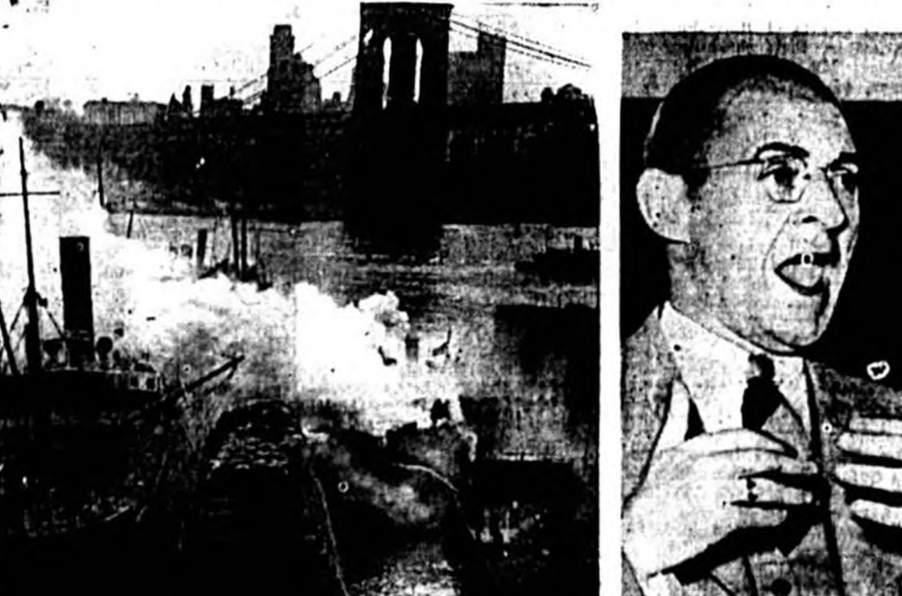
Mariner S. Eccles