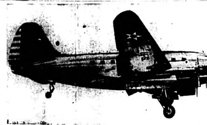
Shown in flight is the new Curtiss plane, which has just been accepted by the United States Army as the first of a large number of transport planes to be produced in Buffalo and St. Louis plants. The 20-ton craft is powered by two 1,200-horsepower engines and will be used for carrying troops and cargo.