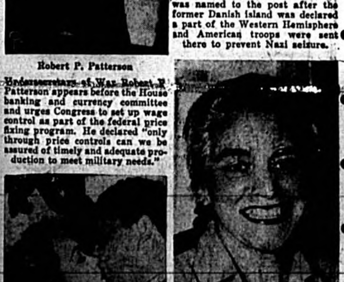
Robert P. Patterson