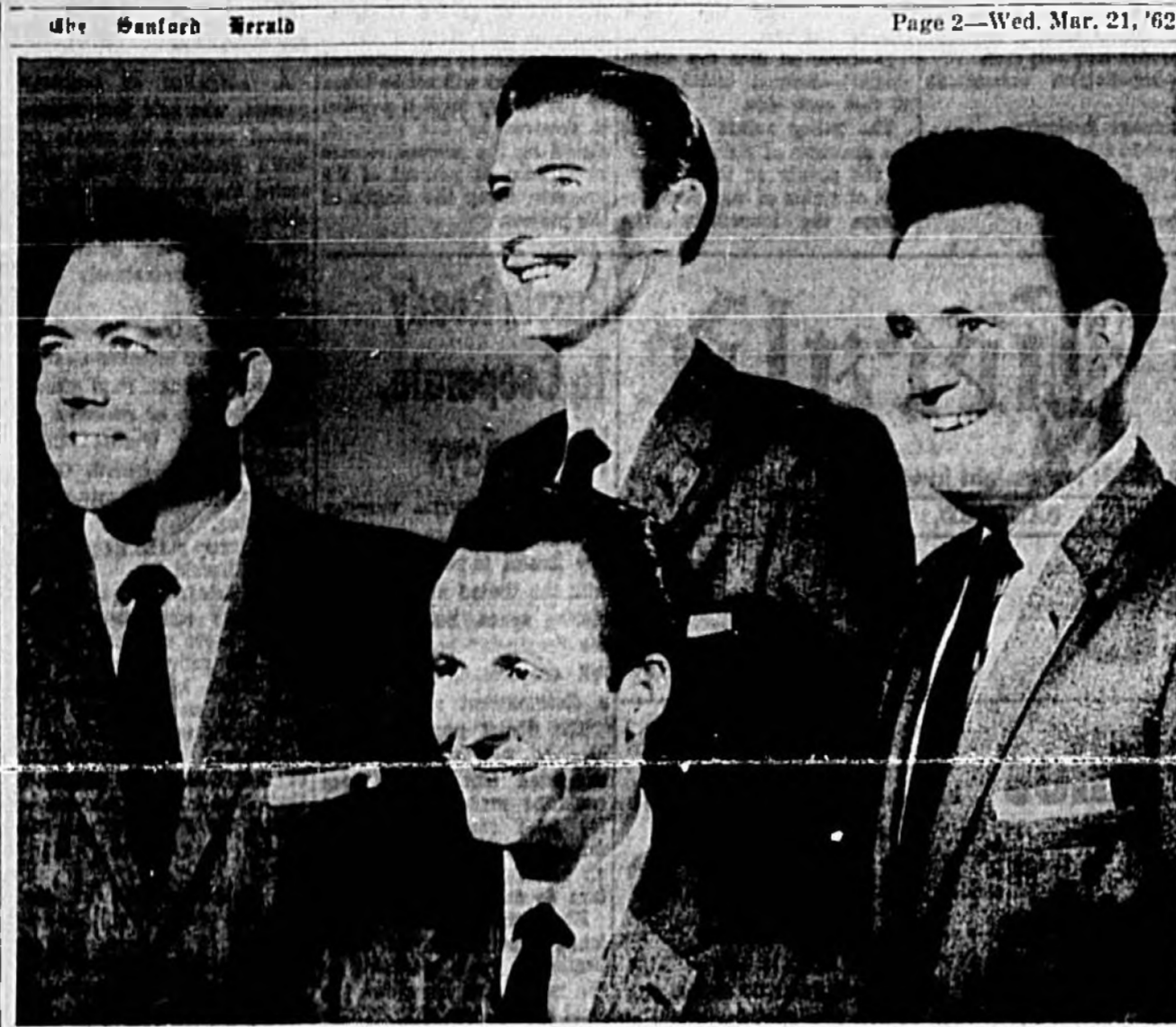
THE FAMOUS REBELS QUARTET will appear at Seminole High School Thursday at 8 p. m. under the sponsorship of the Anchor Club and the Key Club for the benefit of their civic projects.