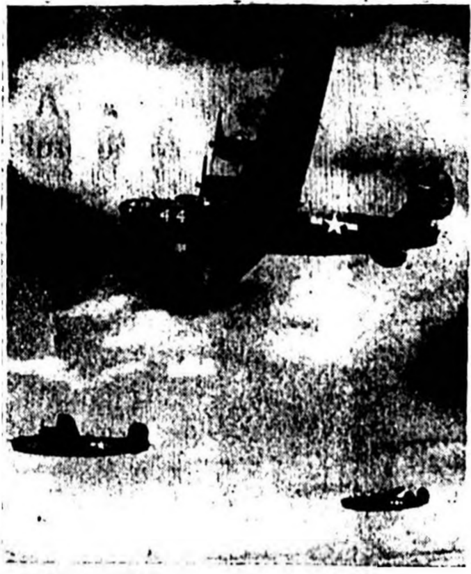
OFF TO BLAST the Japs in their home grounds. Part of the squadron of B-24 bombers that devastated the heavily guarded Luftwaffe base are shown as they set their noses south of the Kamohaka Peninsula. It was from here that the Japs probably launched their attacks on the Alaskan Islands.

WASHINGTON, Oct. 11. (AP) The days of fast action, blank check appropriations for the war and other departments appear to be about over. Fiscal leaders both in the House and Senate made it clear in interviews today that from now on every dollar must be accounted for. Said Chairman Cannon (D-Mo.) of the House Appropriations Committee: "We're past the hump. We've got the spending week. There will be no need in the 1945 (fiscal year) appropriations bill to include huge sums of money for construction and for facilities to produce munitions." Chairman Thomas (D-Ola.) of the Senate Military Appropriations Subcommittee said he had instructed Army budget officers to forget about generalized lump sum appropriations.