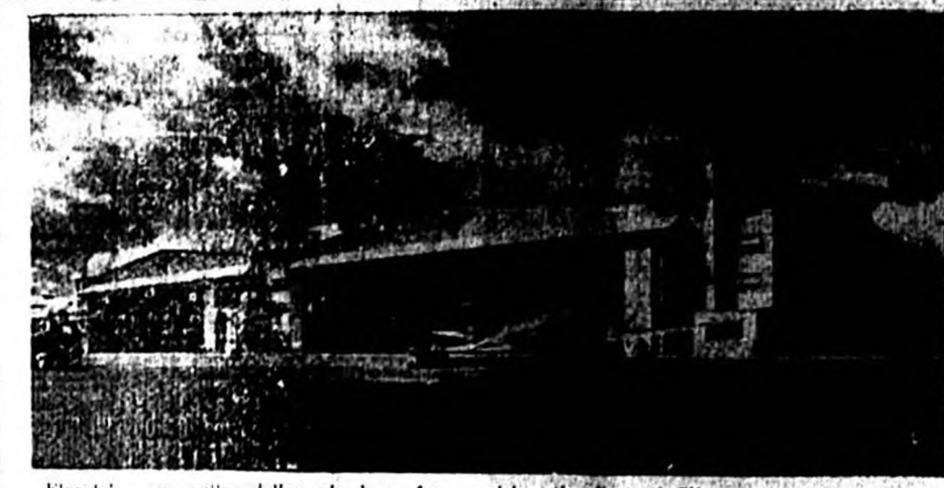
Florida's six million dollar air base for servicing the fleet of Clippers that carry more than 100,000 passengers between the Americas each year has been completed by Pan American Airways. The building, which provides facilities for servicing from 12 to 15 Clippers at one time, covers two and a half square acres of ground and contains 1,000,000 sq. ft. of space.